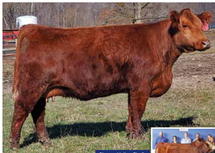
Simme Valley Firefly