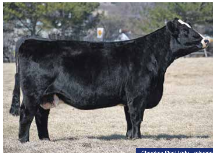
Cherokee Steel Lady - reference