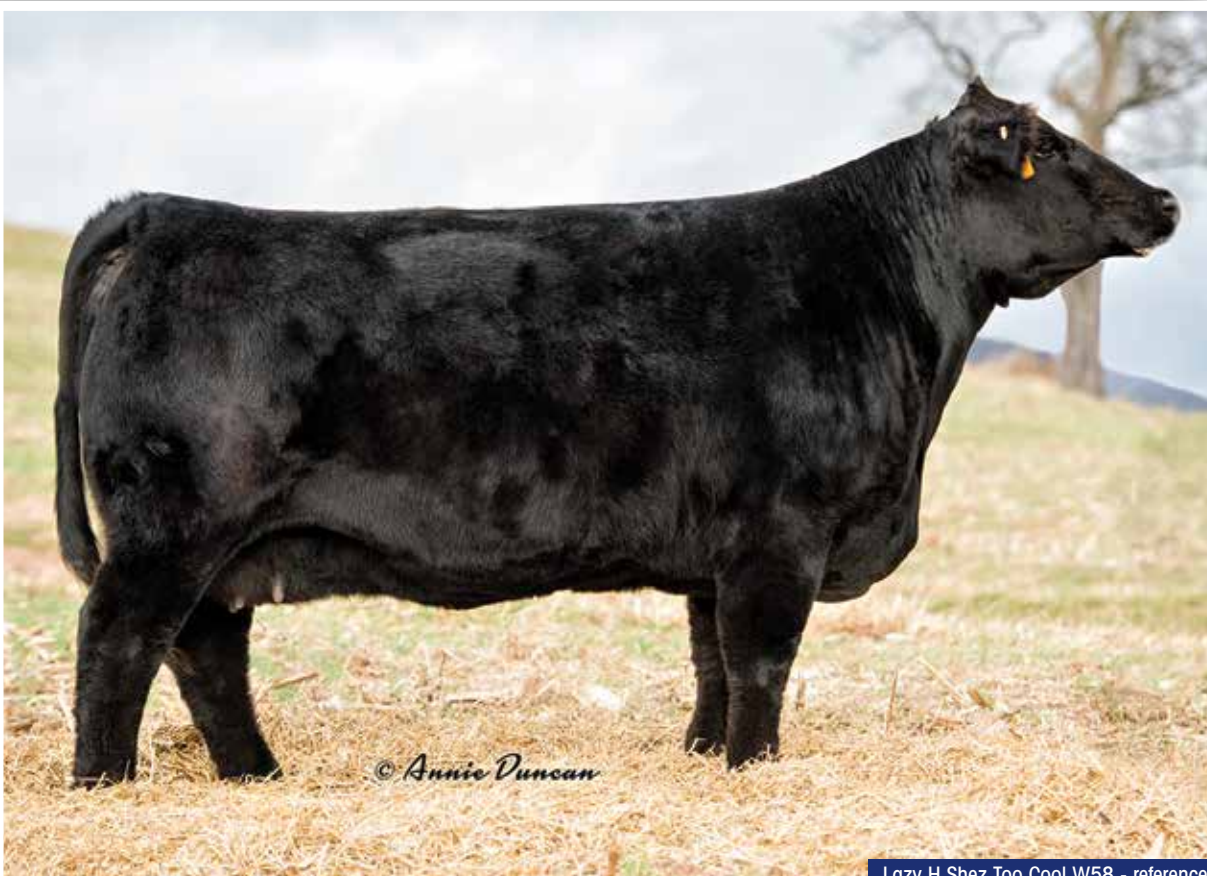
Lazy H Shez Too Cool W58 - reference