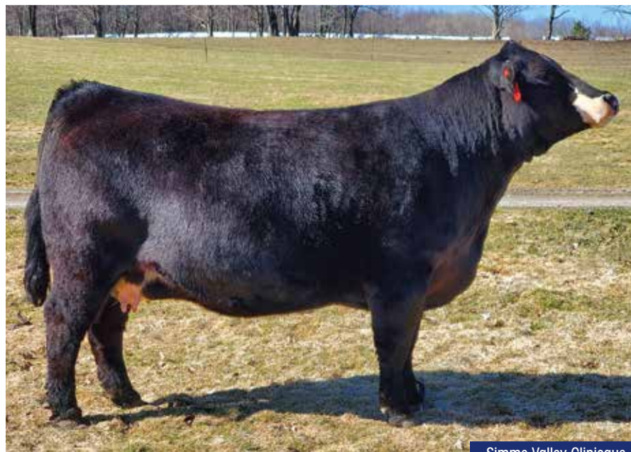
Simme Valley Clinique