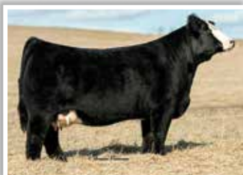
SSC Victorias Secret - daughter