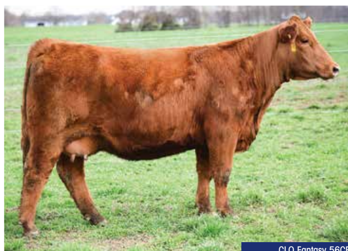
CLO Fantasy 56CF

bred AI to CDI Innovator 325D, ASA#3152448