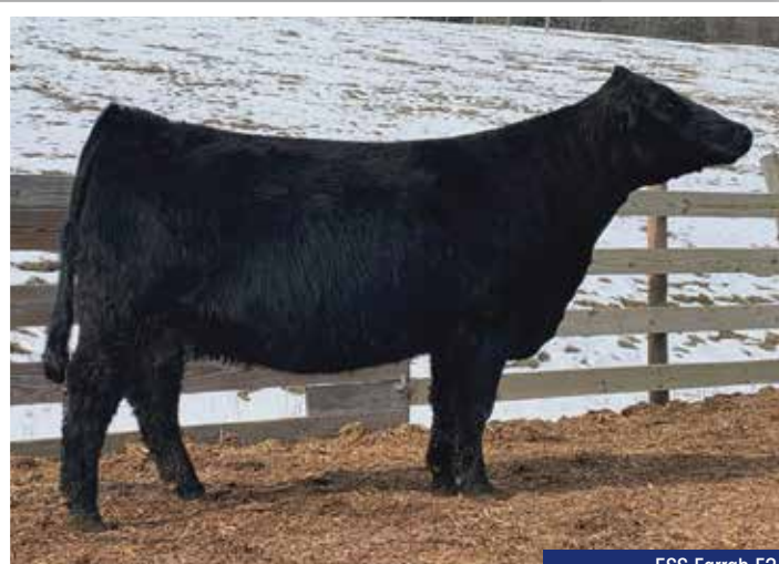
ESS Farrah F21