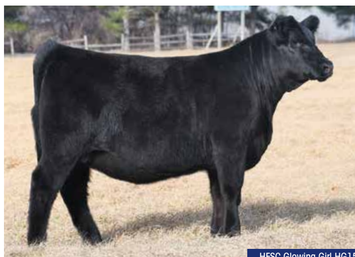
HFSC Glowing Girl HG15