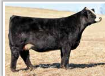
SSC Miss Cool Butt - daughter