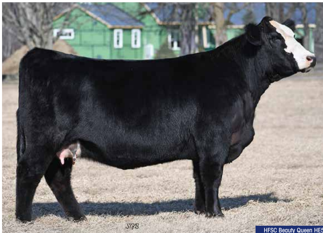
HFSC Beauty Queen HE5