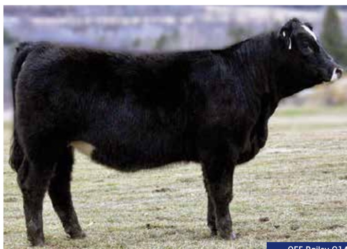
OEF Bailey G14