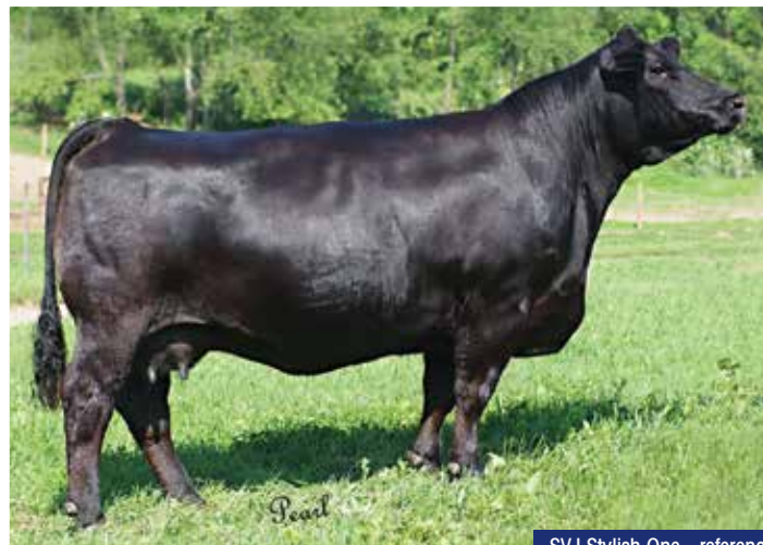
SVJ Stylish One - reference