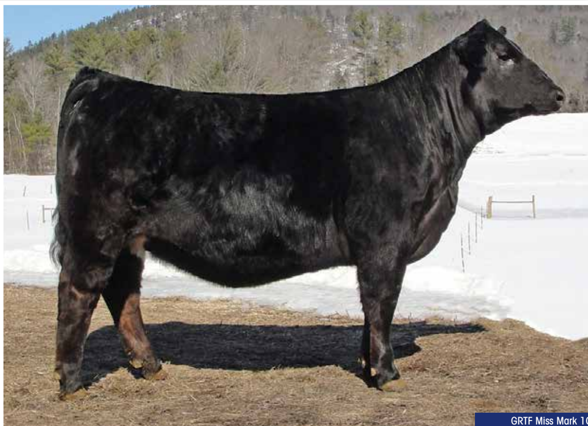
GRTF Miss Mark 1G