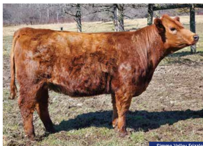
Simme Valley Frizzly