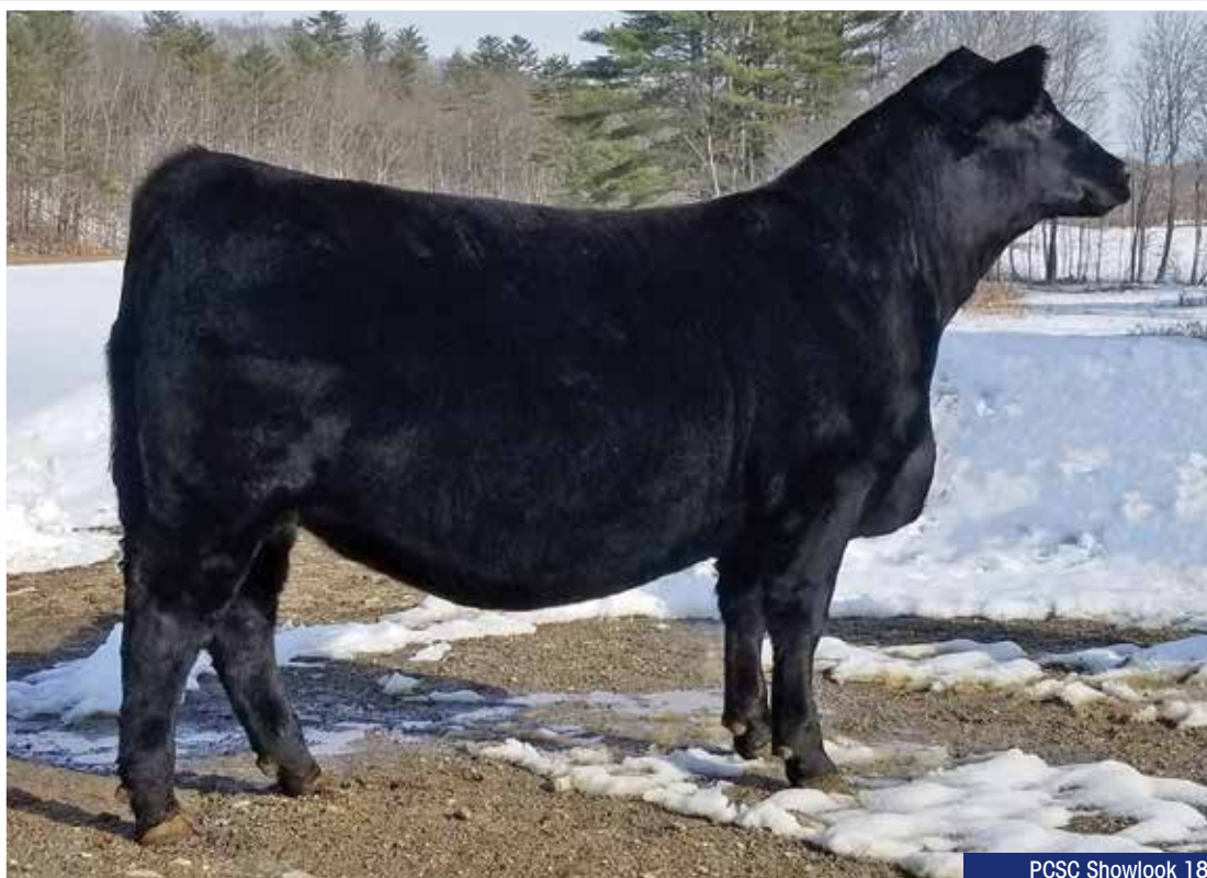
PCSC Showlook 18G