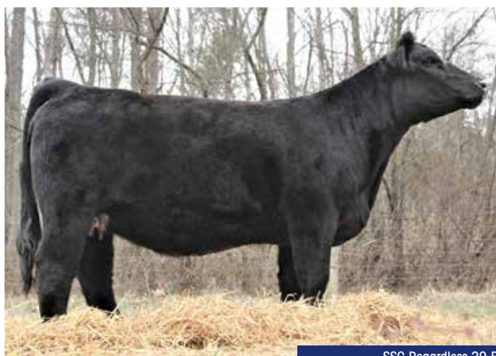
SSC Regardless 29 E