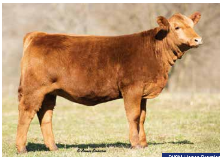
PVSM Hopes Promise