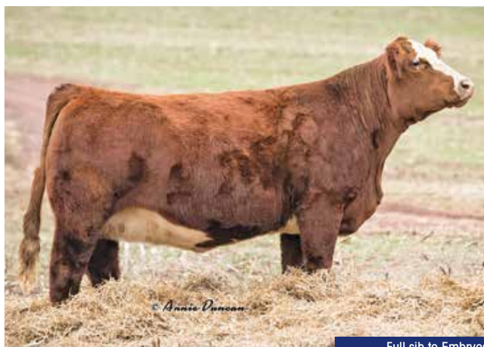
Full sib to Embryos