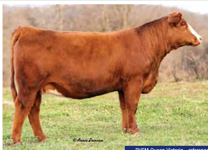
PVSM Queen Victoria - reference