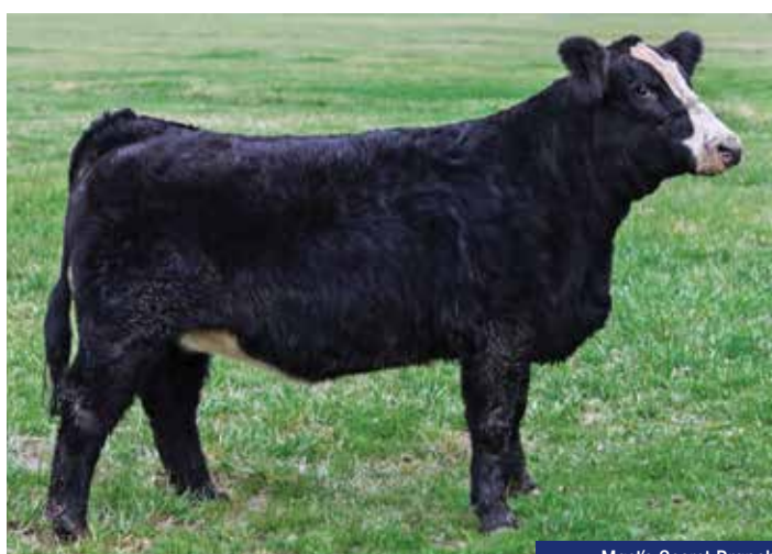
Mast's Secret Branch