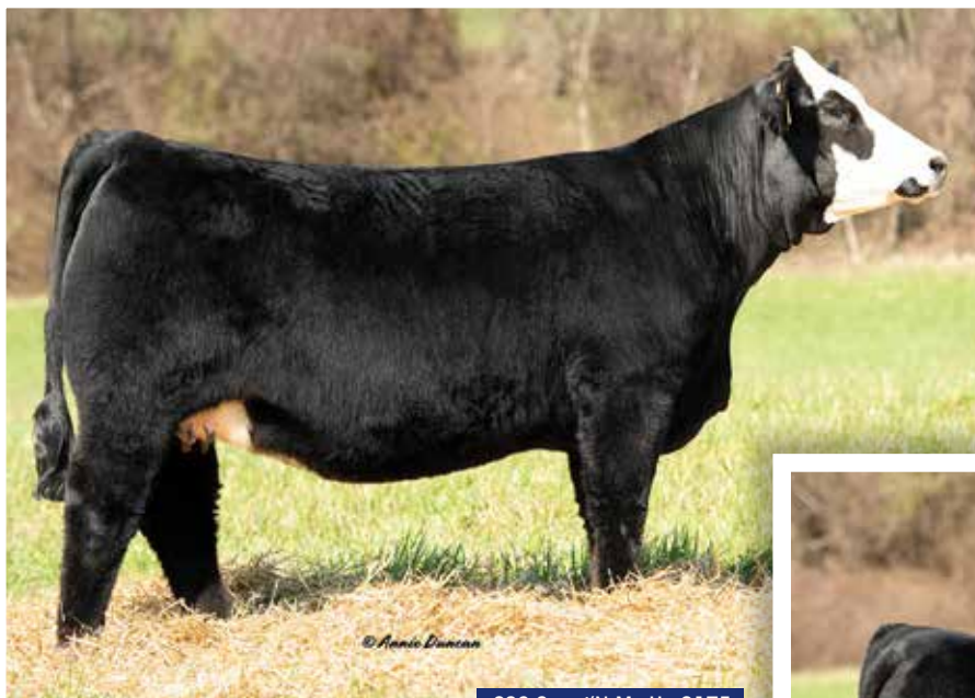
SSC Sweet`N Me Up 217F