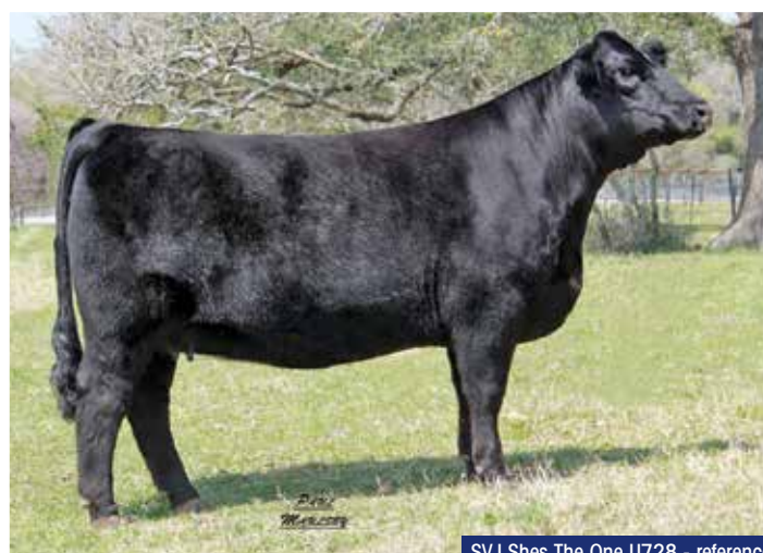
SVJ Shes The One U728 - reference