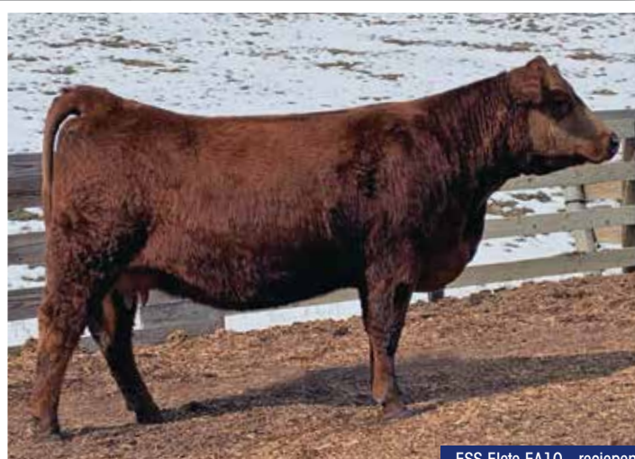
ESS Elete EA10 - recipient

pasture exposed to WHF/PRS Game On 001Y, ASA#2637352 on 3/28/20 consignor: Elm Side Farm