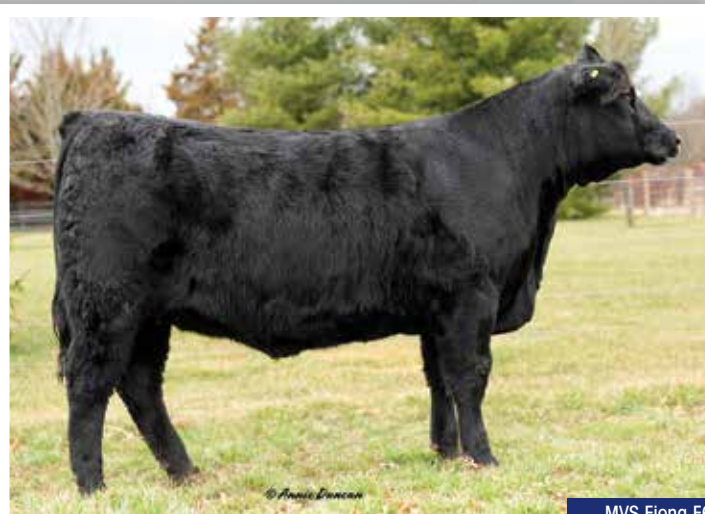
MVS Fiona F6