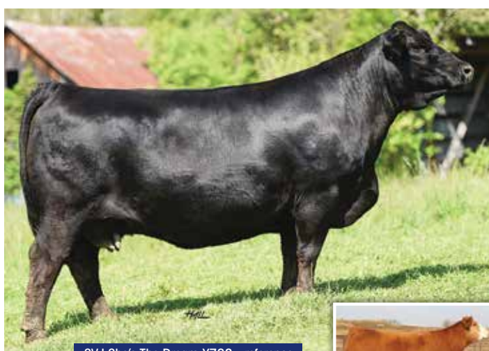
SVJ She's The Dream Y728 - reference