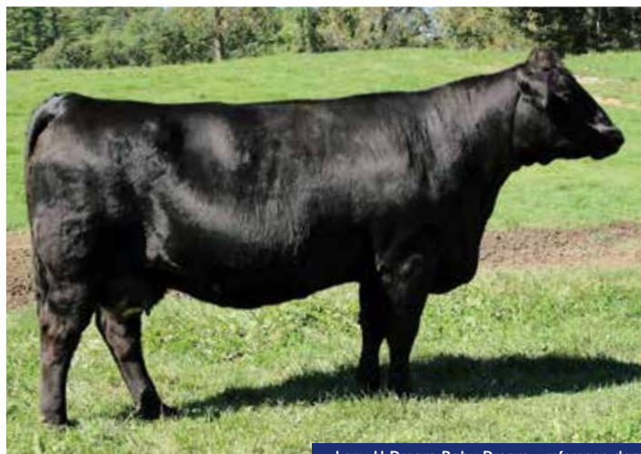
Lazy H Dream Baby Dream - reference dam