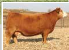
B798 - reference