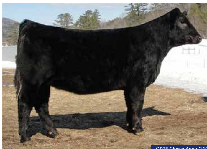
GRTF Classy Anne 24G