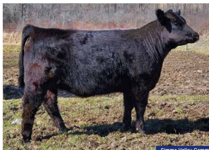
Simme Valley Gemma