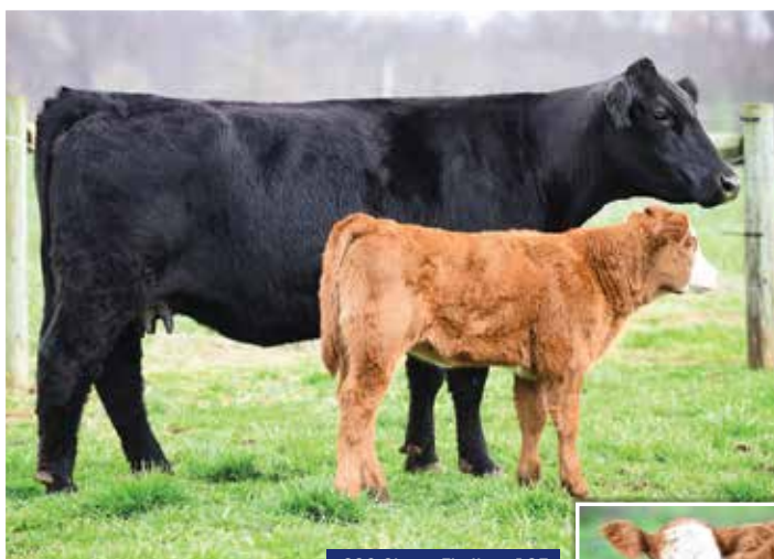
SSC Sheza Flatliner 13E