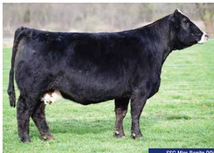
SSC Miss Bonita 99A