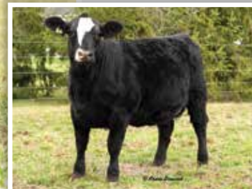
MVS Fredricka F11