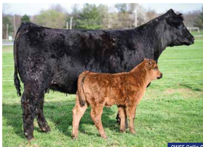
CWSF Callie C4

• consignor: Curry Wagner Simmental Farm