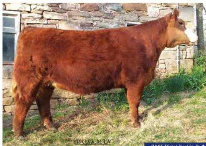
CBSF Pistol Packin Polly

• consignor: Curry Wagner Simmental Farm