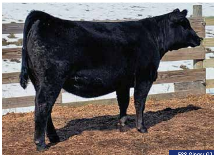
ESS Ginger G11