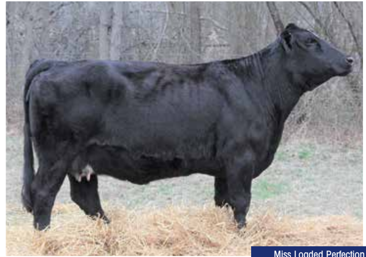
Miss Loaded Perfection