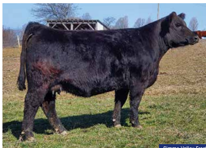
Simme Valley Frosty