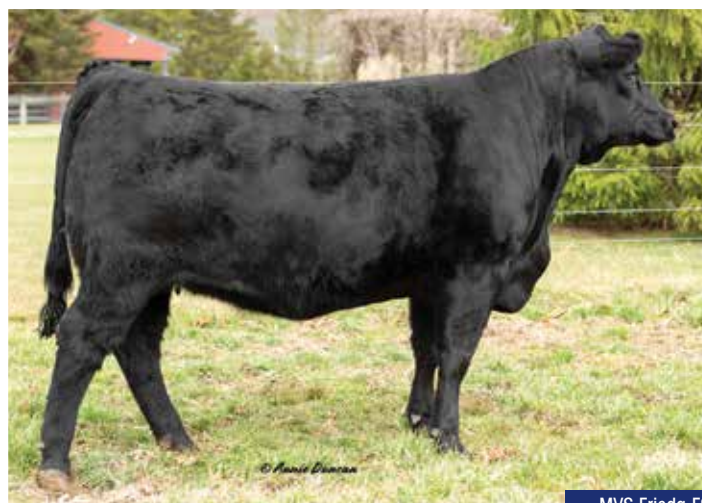
MVS Frieda F9