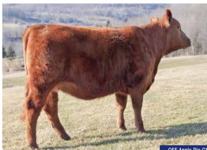
OEF Apple Pie G8