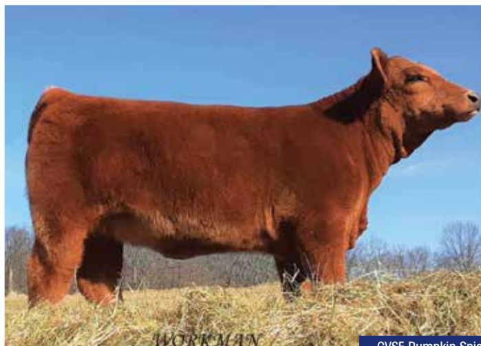
CVSF Pumpkin Spice