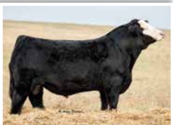
SSC Shell Shocked - son