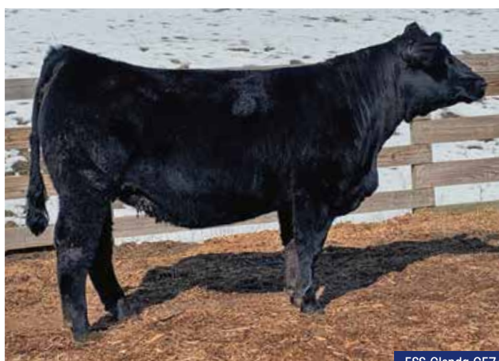
ESS Glenda GE74