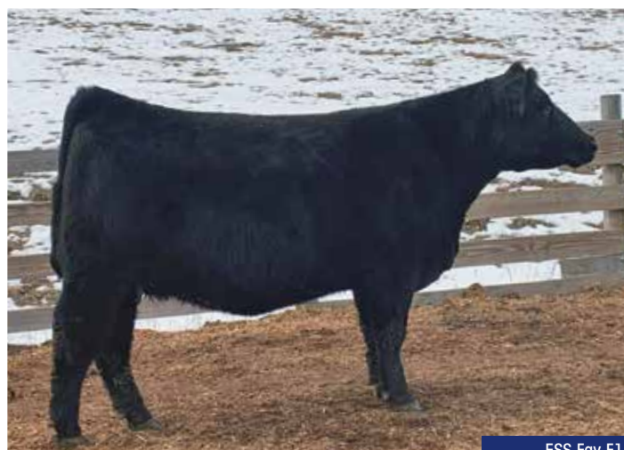
ESS Fay F11