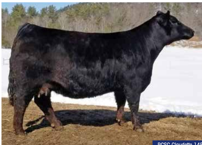
PCSC Claudette 14E