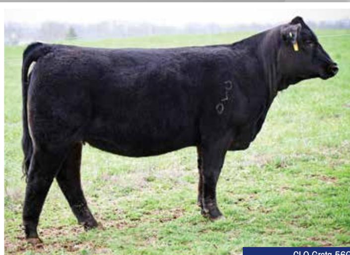
CLO Greta 56G