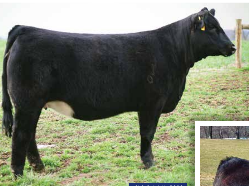
CLO Gabrielle 56CG