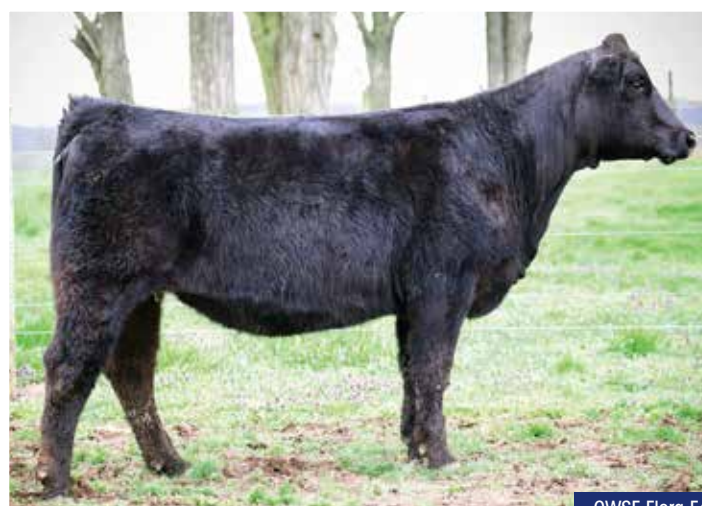
CWSF Flora F4

Videos available at www.dponlinesales.com