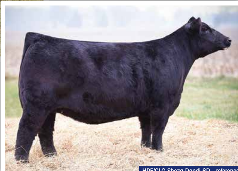
HPF/CLO Sheza Dandi 6D - reference