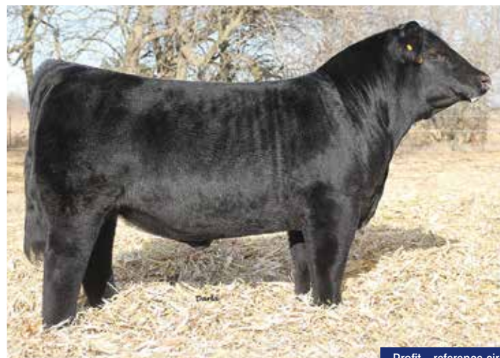
Profit - reference sire