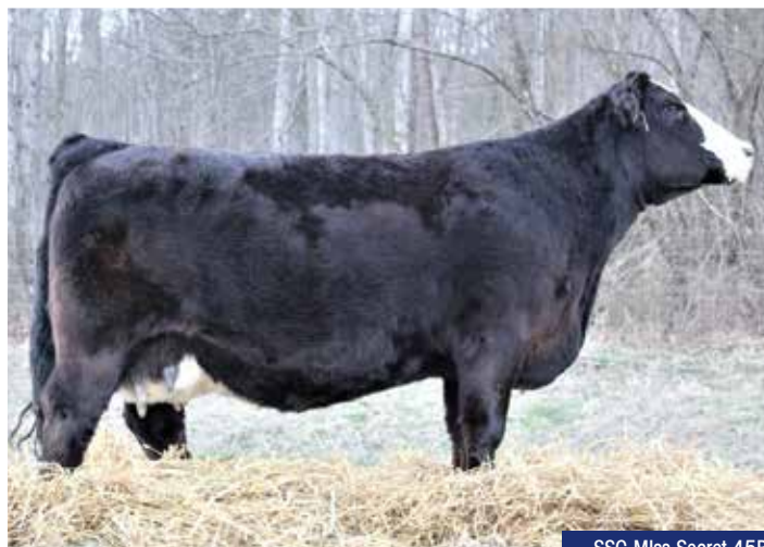
SSC Miss Secret 45B