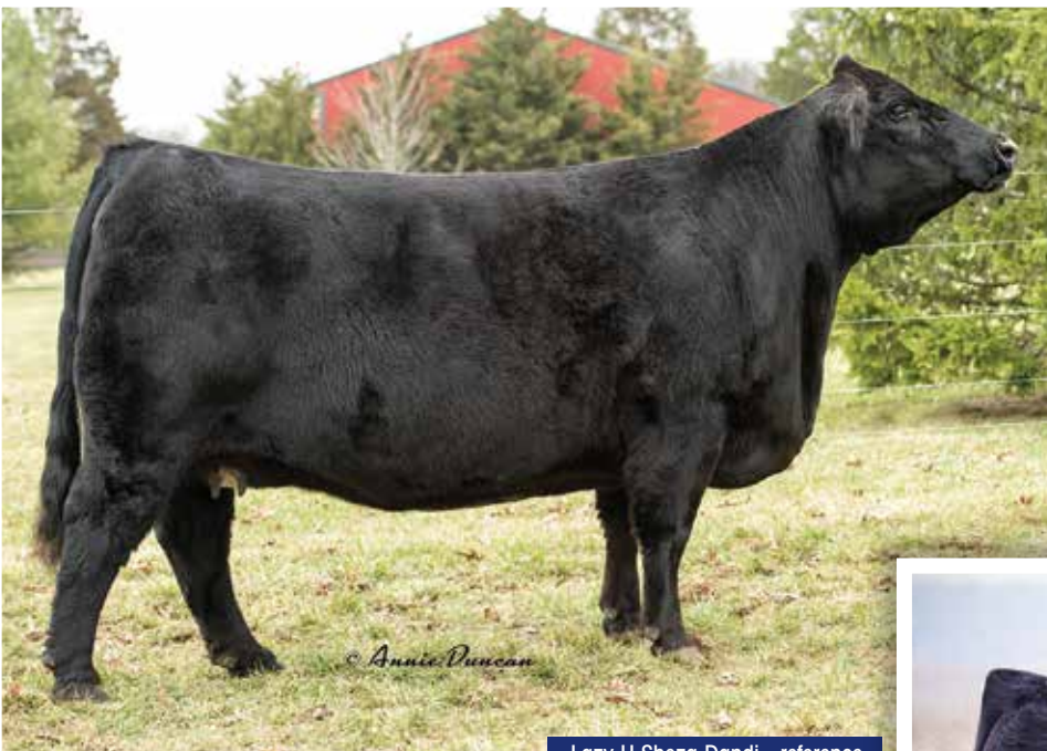
Lazy H Sheza Dandi - reference