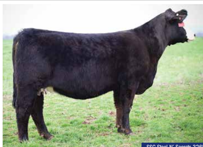
SSC Steel N' Secrets 326F