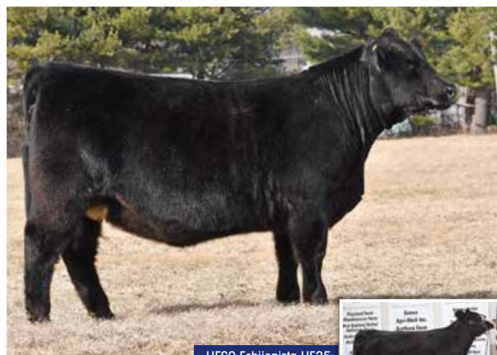
HFSC Fashionista HF25