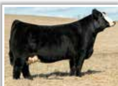
SSC Victorias Secret 49B - reference dam