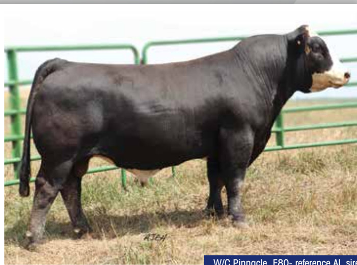
W/C Pinnacle E80- reference AI sire