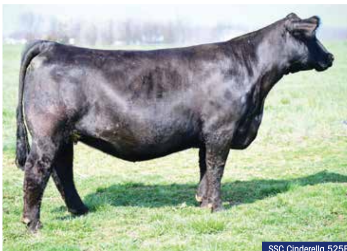
SSC Cinderella 525E