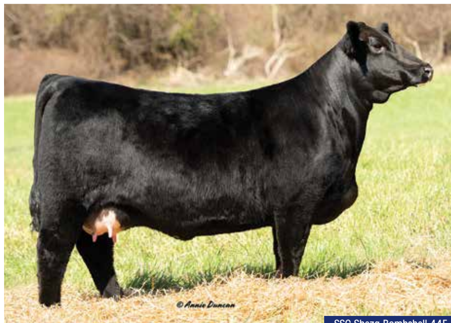
SSC Sheza Bombshell 44F