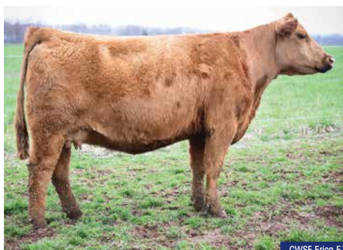
CWSF Erica E1

• consignor: Curry Wagner Simmental Farm