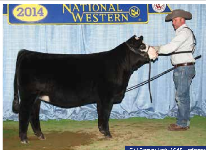
SVJ Forever Lady A648 - reference