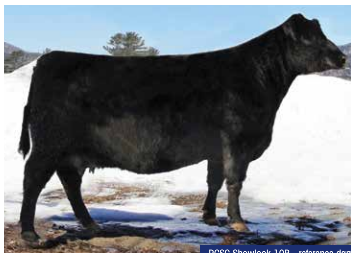
PCSC Showlook 10B - reference dam

Videos available at www.dponlinesales.com