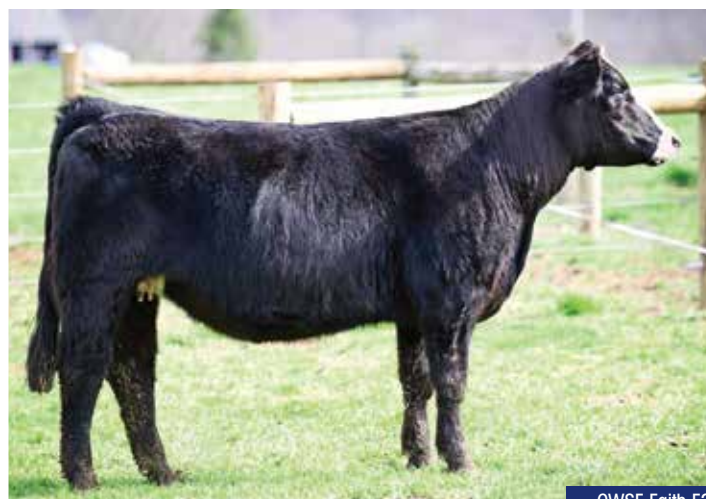
CWSF Faith F2