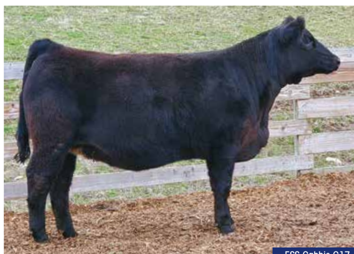
ESS Gabbie G17