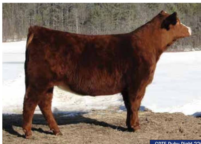
GRTF Ruby Right 22G