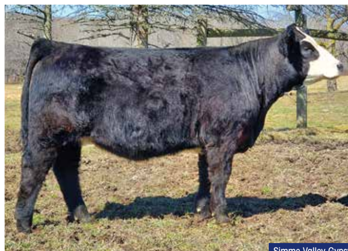
Simme Valley Gypsy