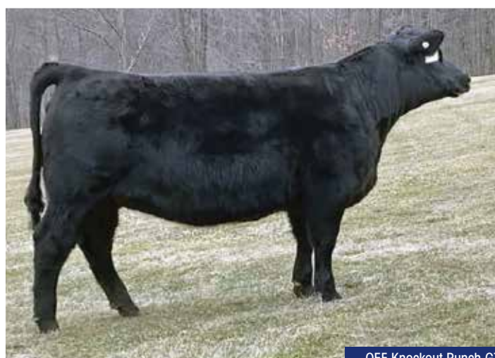
OEF Knockout Punch G7