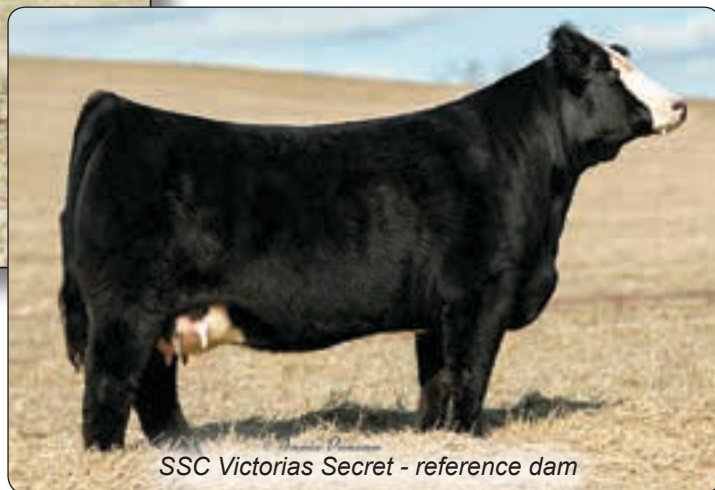
SSC Victorias Secret - reference dam