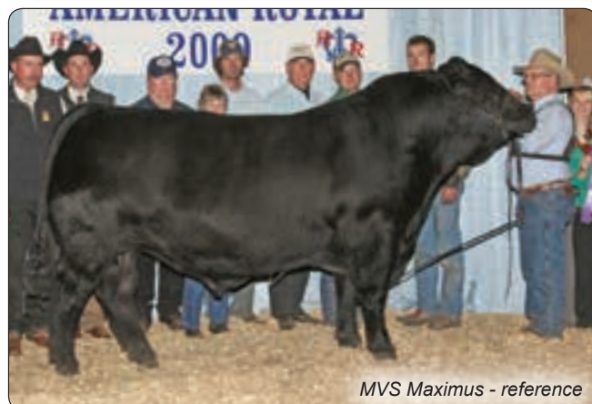
MVS Maximus - reference