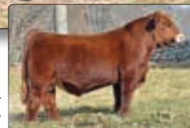
HPF Tradecraft - reference AI sire