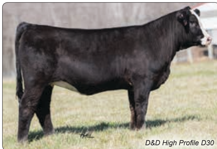
D&amp;D High Profile D30