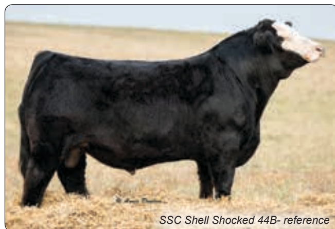
SSC Shell Shocked 44B- reference

• 2016 high selling bull at $17,250 selling to KenCo Cattle and Fenton Farms