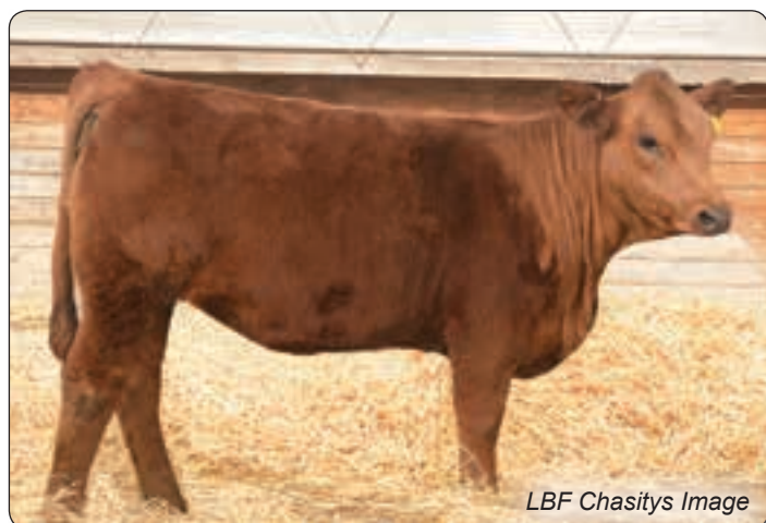
LBF Chasity's Image