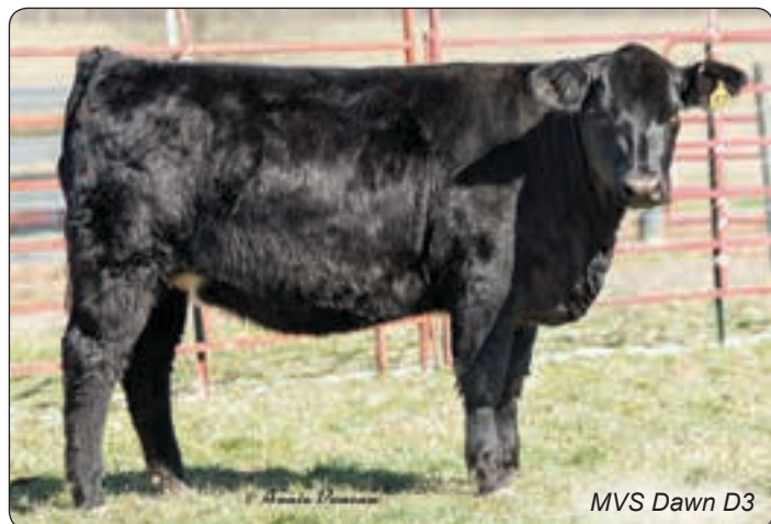
MVS Dawn D3