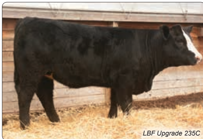
LBF Upgrade 235C