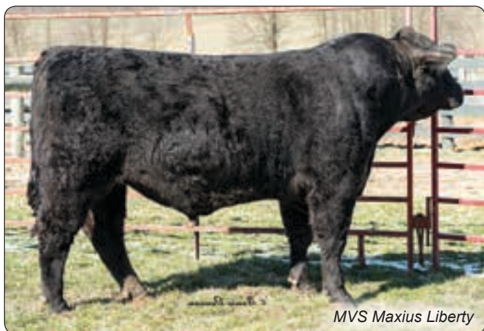
MVS Maxius Liberty