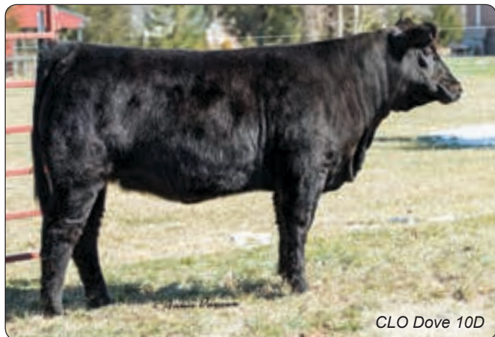
CLO Dove 10D