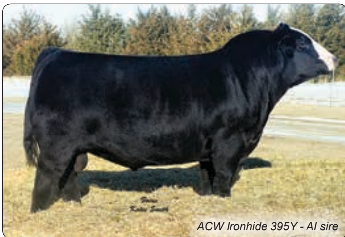
ACW Ironhide 395Y - AI sire