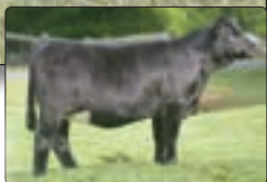
CMFM Sazerac 86Y daughter - reference