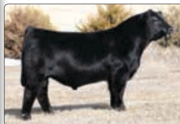
W/C Relentless - reference