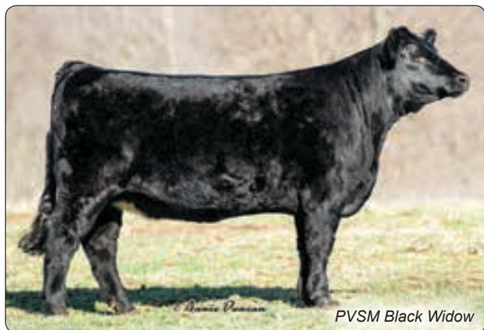
PVSM Black Widow