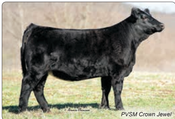
PVSM Crown Jewel