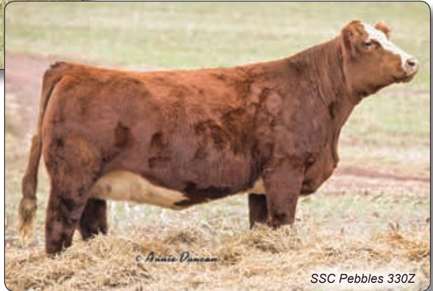
SSC Pebbles 330Z