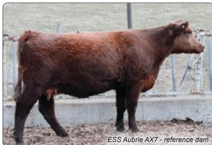
ESS Aubrie AX7 - reference dam