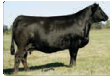
DMN Daisy Mae - ref. dam