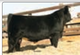
TLLC One Eyed Jack - reference sire