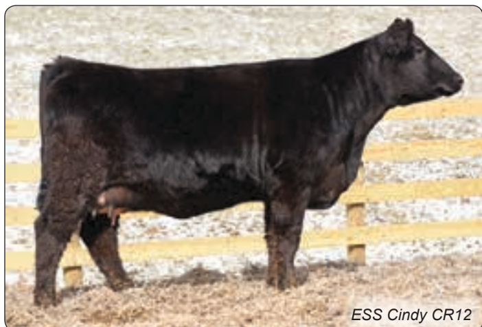
ESS Cindy CR12