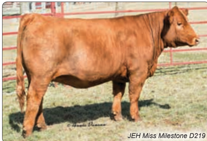
JEH Miss Milestone D219