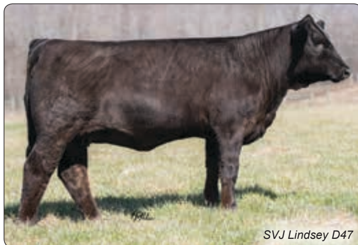
SVJ Lindsey D47