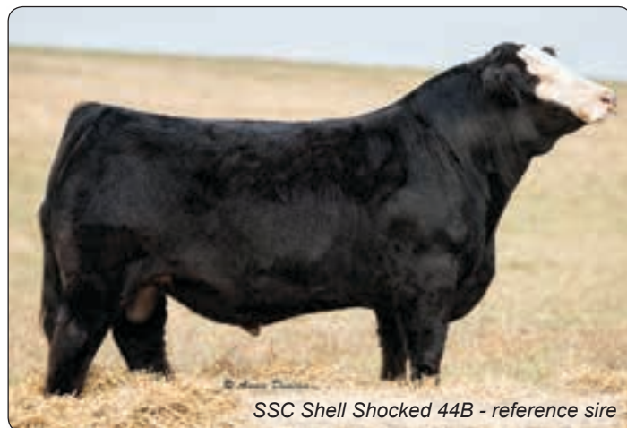
SSC Shell Shocked 44B - reference sire