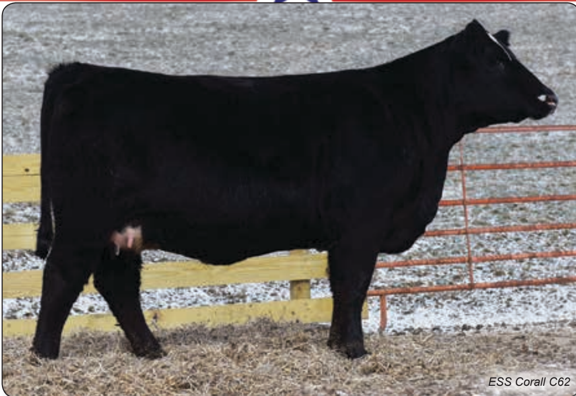
ESS Coral C62