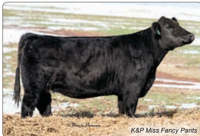
K&amp;P Miss Fancy Pants