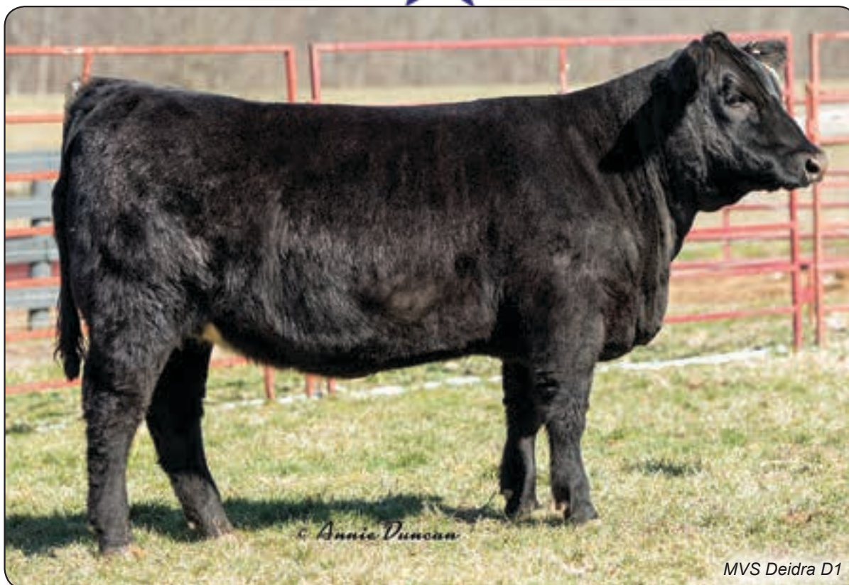
MVS Deidra D1