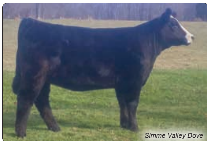
Simme Valley Dove