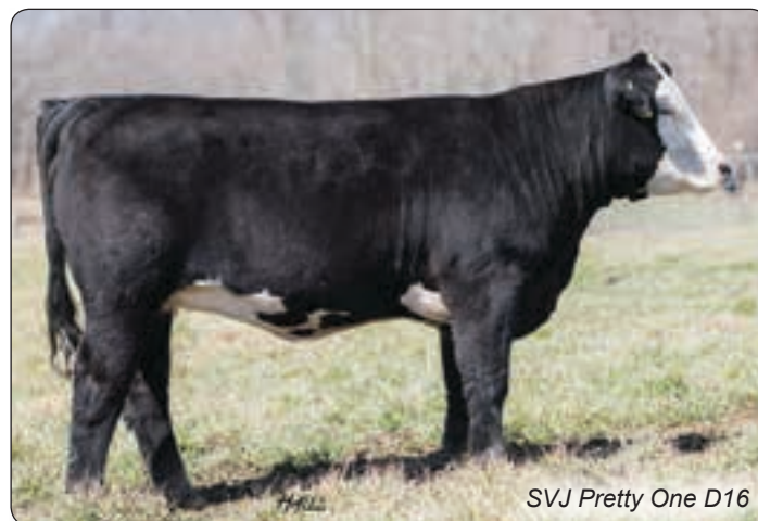
SVJ Pretty One D16