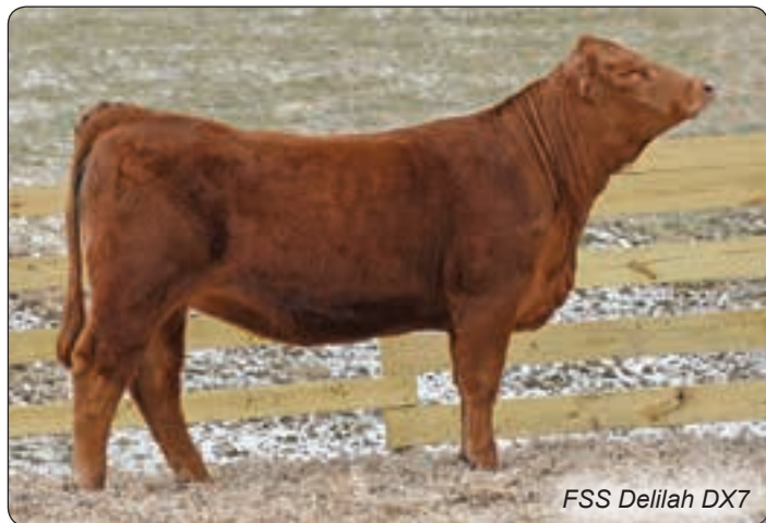
ESS Delilah DX7