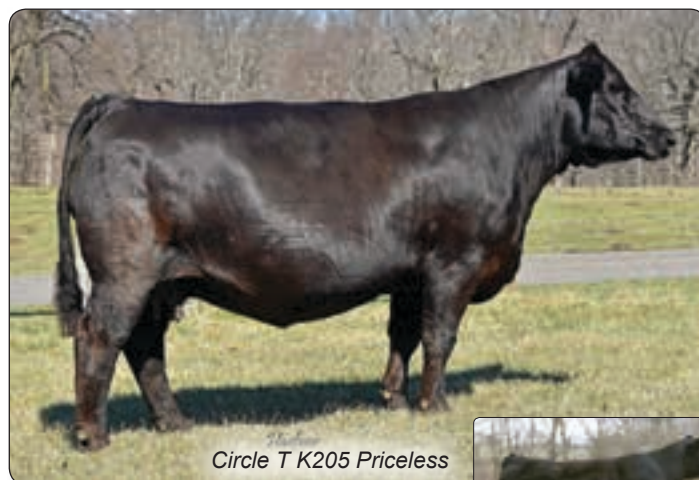
Circle T K205 Priceless