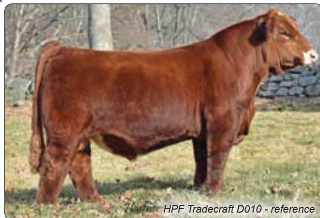
HPF Tradecraft D010 - reference