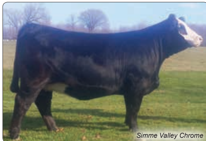
Simme Valley Chrome