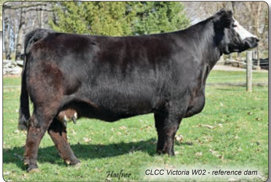
CLCC Victoria W02 - reference dam