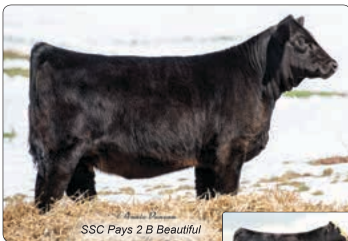
SSC Pays 2 B Beautiful

MF Miss Built Right U553 - reference dam