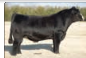
SVF Steel Force S701 - reference sire