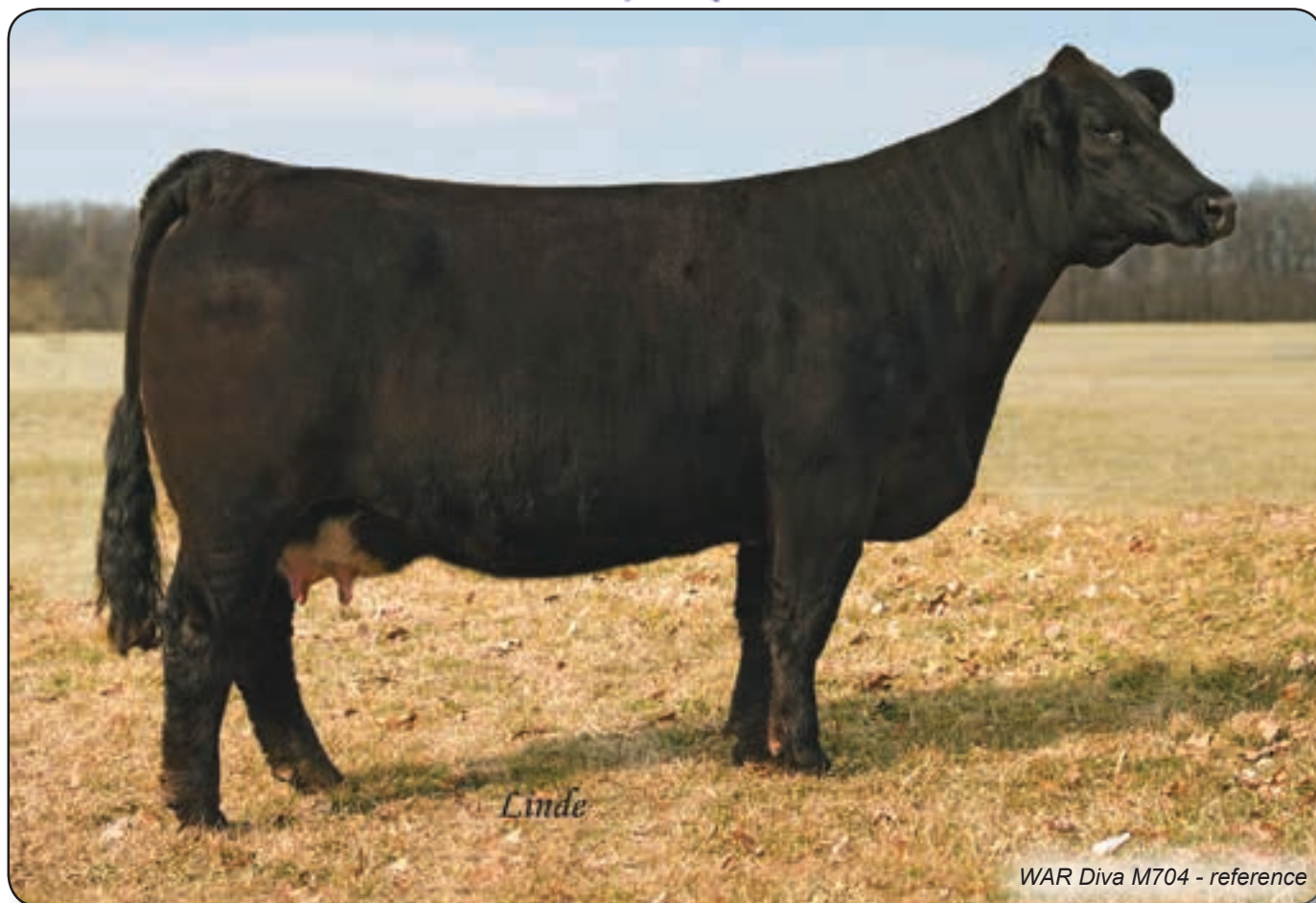
WAR Diva M704 - reference