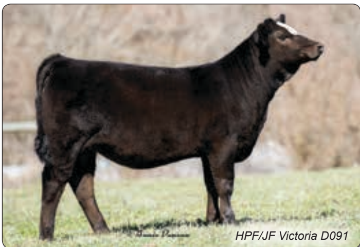
HPF/JF Victoria D091