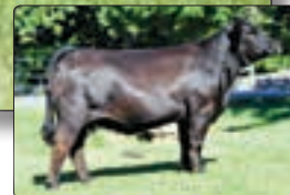
HPF Caliente U335 - ref. dam