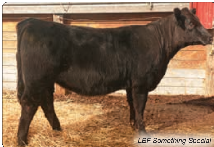
LBF Something Special