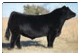
LLSF Pays To Believe - reference sire