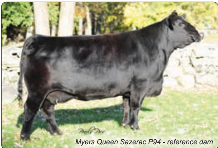
Myers Queen Sazerac P94 - reference dam