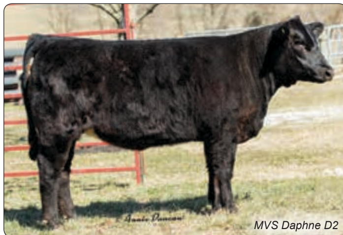
MVS Daphne D2