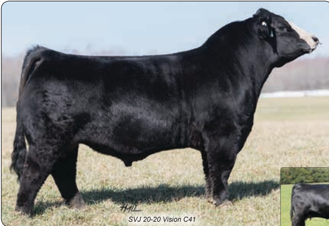
SVJ 20-20 Vision C41