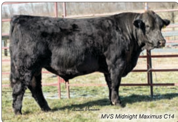
MVS Midnight Maximus C14