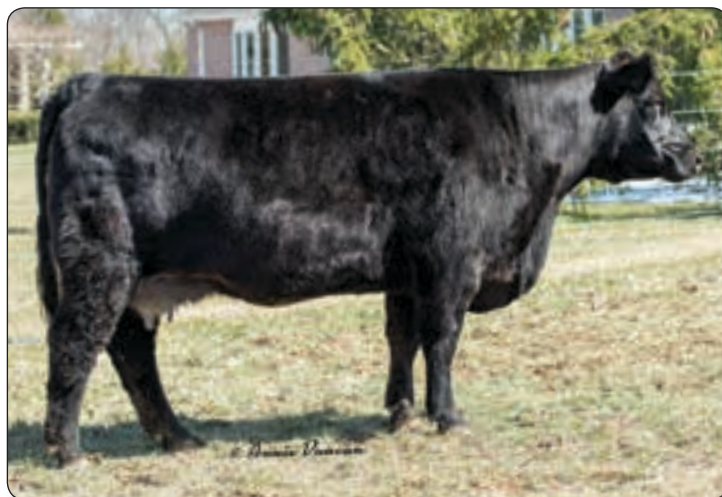
CLO American Maiden 70Z