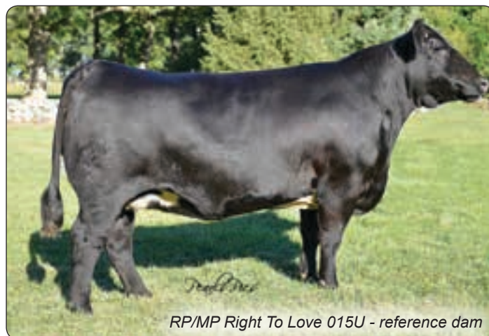
RP/MP Right To Love 015U - reference dam