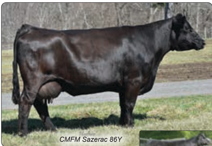
CMFM Sazerac 86Y