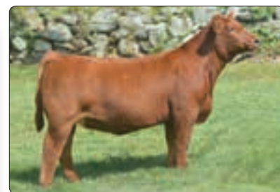
Full sib to D074- reference