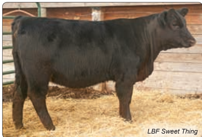
LBF Sweet Thing