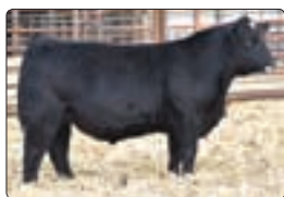
Hook's Broadway 11B - reference sire