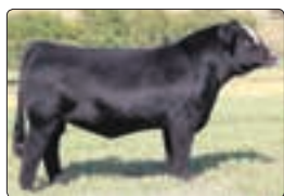
Mr CCF 20-20 - reference sire