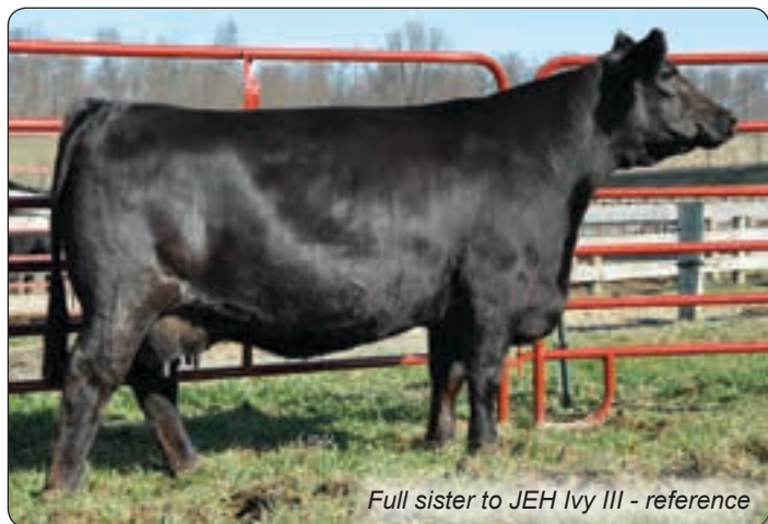
Full sister to JEH Ivy III - reference