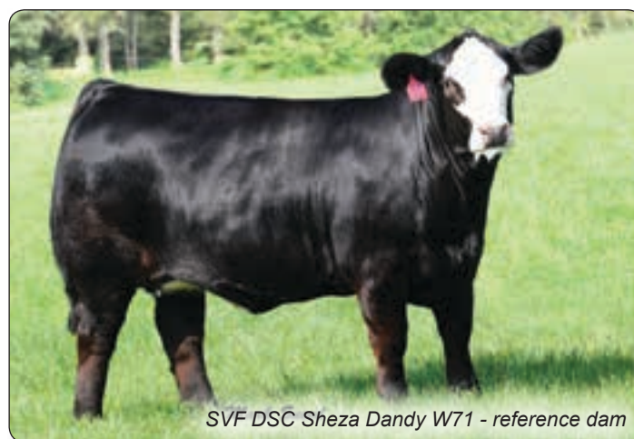
SVF DSC Sheza Dandy W71 - reference dam