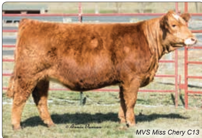
MVS Miss Chery C13