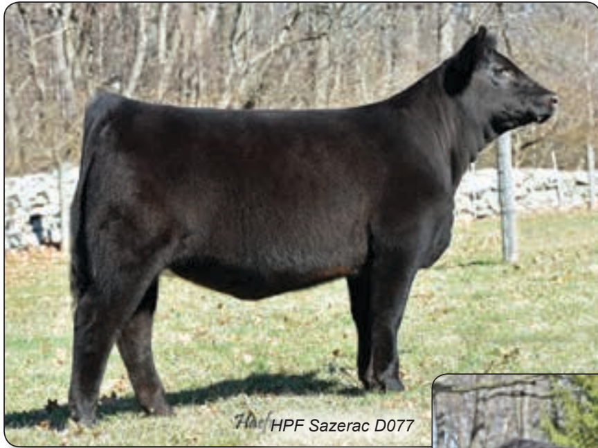
HPF Sazerac D077