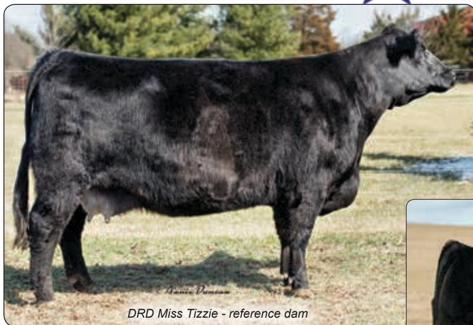
DRD Miss Tizzie - reference dam