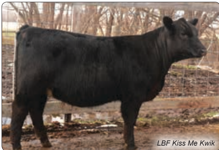
LBF Kiss Me Kwik

Mountain View Farm is located in the antique capital of the nation centered in Adams and Lancaster counties. The nearby Gettysburg Outlet Mall offers shopping at numerous famous brand stores.