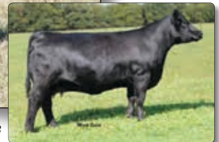
SVJ Queen Me U613 - reference dam