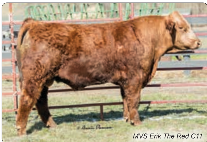
MVS Erik The Red C11