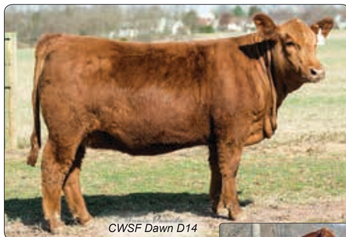
CWSF Dawn D14