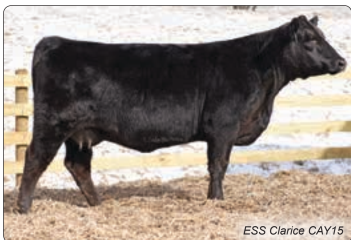
ESS Clarice CAY15

Immediately adjacent to Mountain View Farm is the "Land of Little Horses" which provides a great miniature horse show for the youngsters.