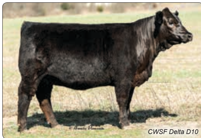
CWSF Delta D10