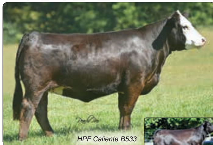
HPF Caliente B533