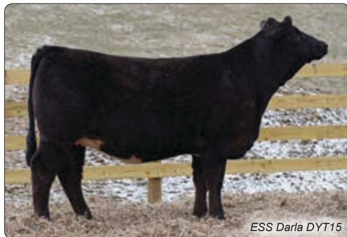
ESS Darla DYT15