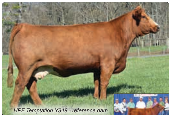
HPF Temptation Y348 - reference dam