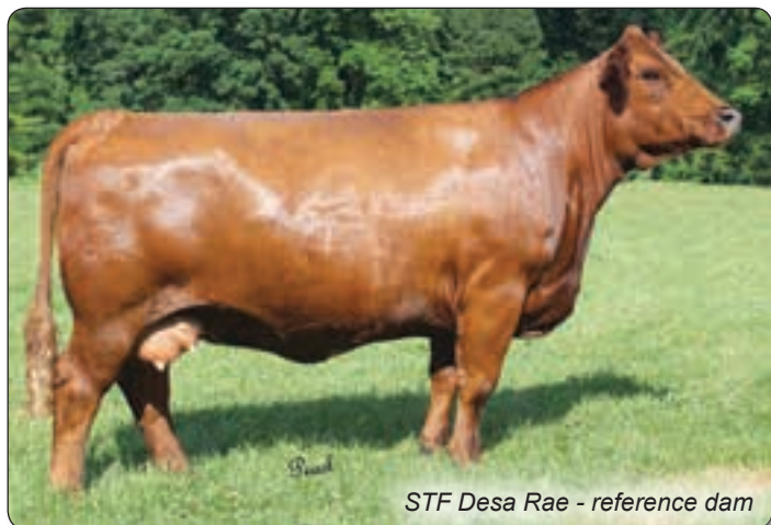
STF Desa Rae - reference dam