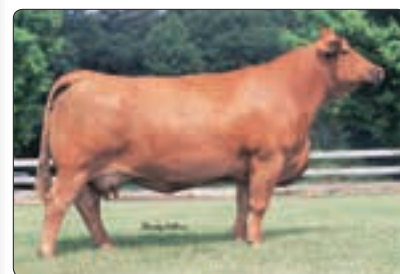
GFI Candace G51 - reference