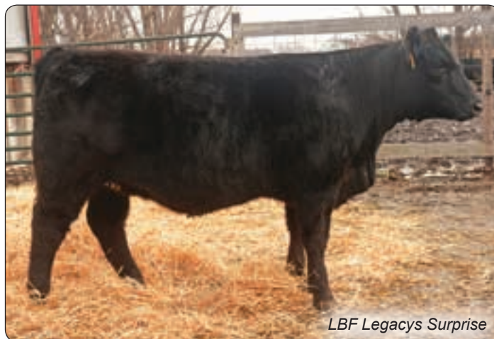
LBF Legacys Surprise