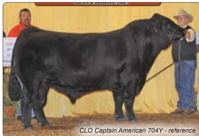
CLO Captain American 704Y - reference