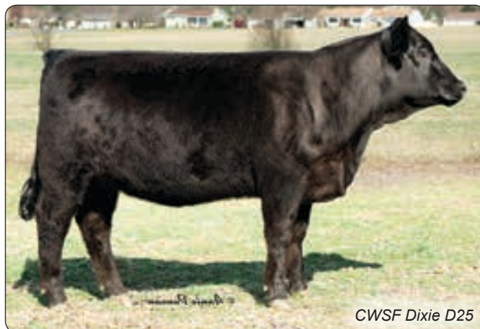
CWSF Dixie D25