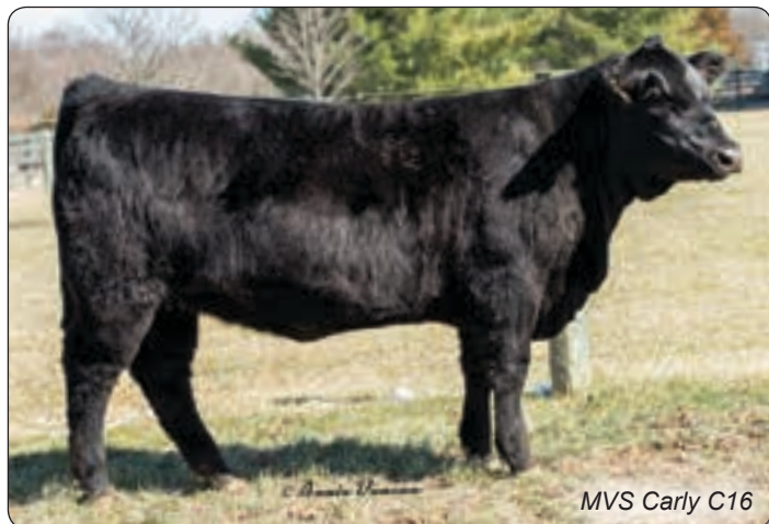
MVS Carly C16