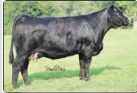
CLRWTR Sazerac W94B - ref dam