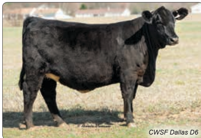
CWSF Dallas D6