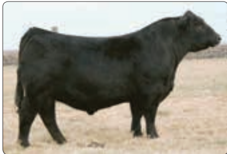
W/C Executive Order - ref sire