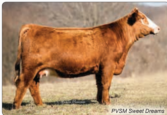
PVSM Sweet Dreams