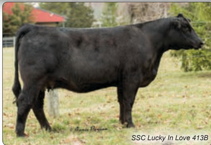
SSC Lucky In Love 413B