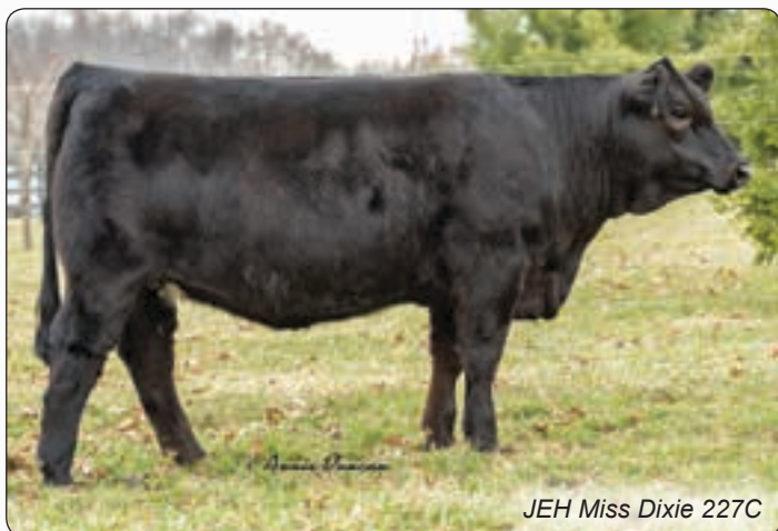
JEH Miss Dixie 227C