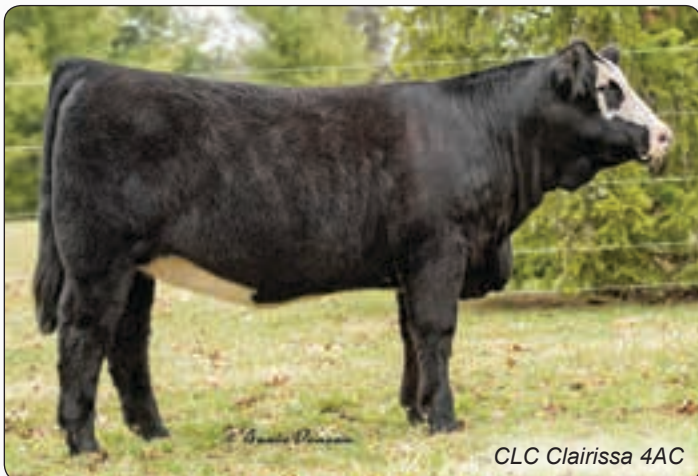
CLC Clairissa 4AC

Mountain View Farm is located in the antique capital of the nation centered in Adams and Lancaster counties. The nearby Gettysburg Outlet Mall offers shopping at numerous famous brand stores.