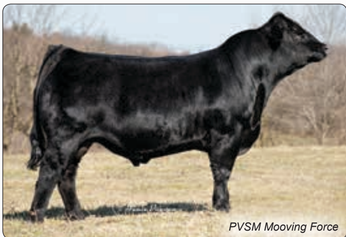
PVSM Mooving Force