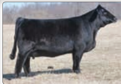
CCR Black Star - reference granddam