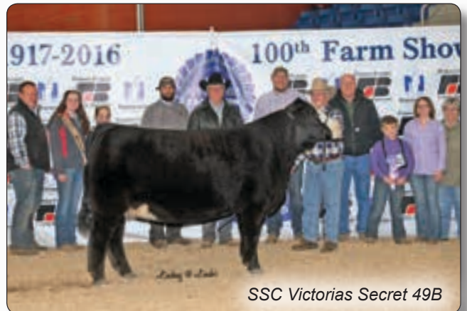
SSC Victorias Secret 49B