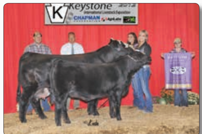
MF Miss Built Right U553- reference dam