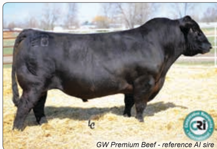
GW Premium Beef - reference AI sire