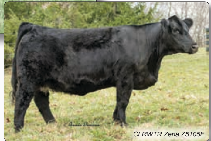
CLRWTR Zena Z5105F