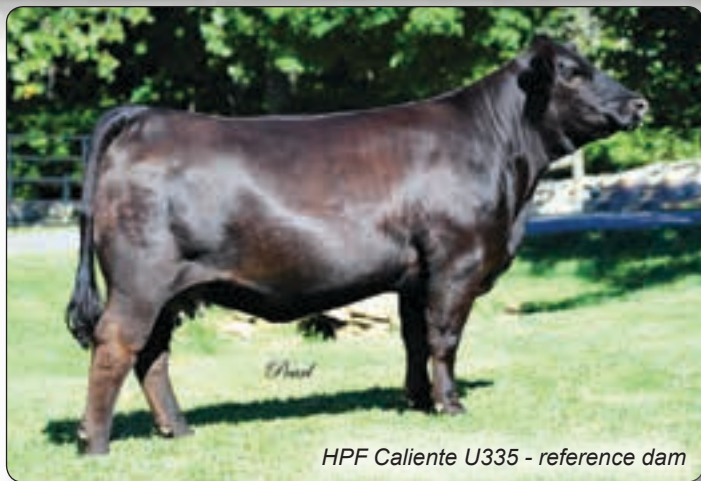
HPF Caliente U335 - reference dam