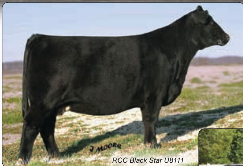
RCC Black Star U8111