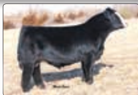
LLSF Uprising Z925 - reference sire