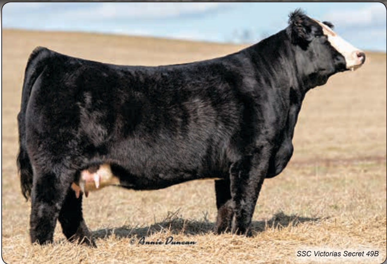
SSC Victorias Secret 49B