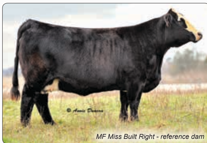
MF Miss Built Right - reference dam