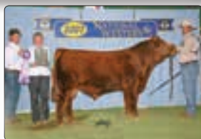
SVJ Wild Fire Dream C788 - reference sire