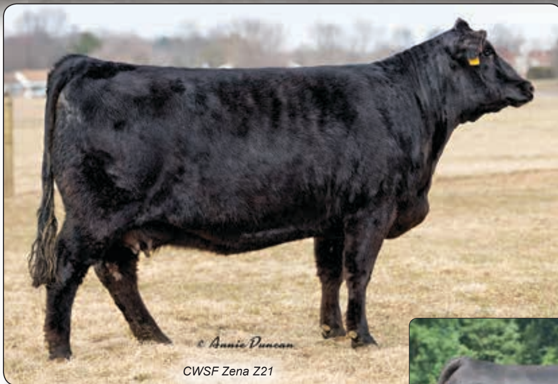
CWSF Zena Z21