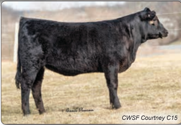
CWSF Courtney C15