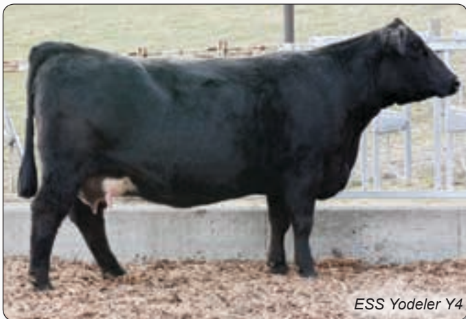
ESS Yodeler Y4