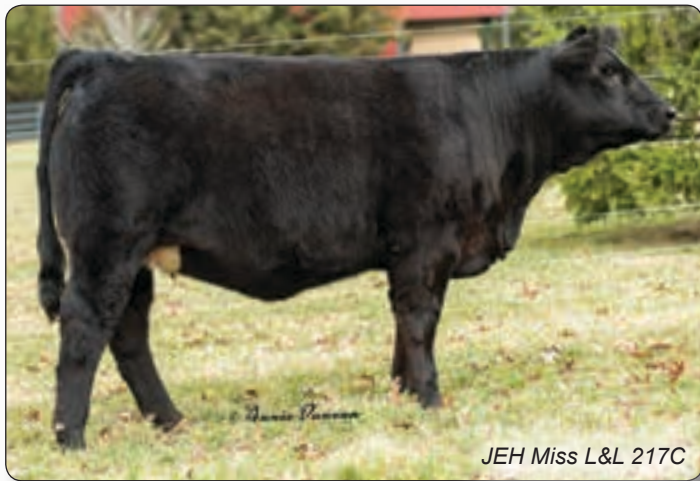
JEH Miss L&L 217C