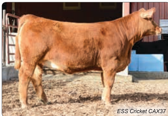
ESS Cricket CAX37