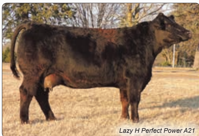
Lazy H Perfect Power A21