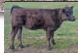
DAX7- Lot 37A