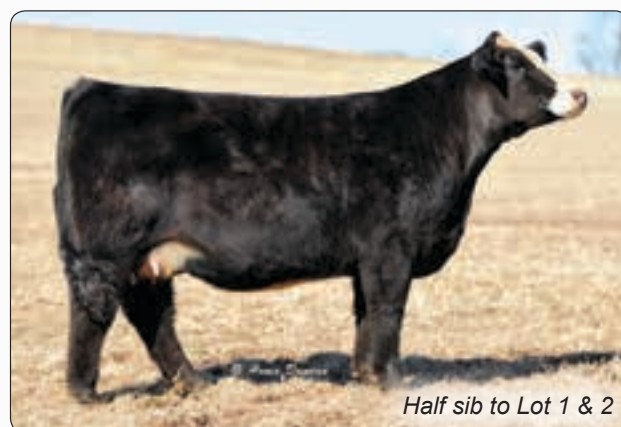
Half sib to Lot 1 & 2