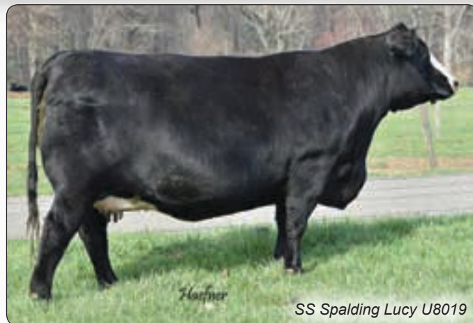
SS Spalding Lucy U8019