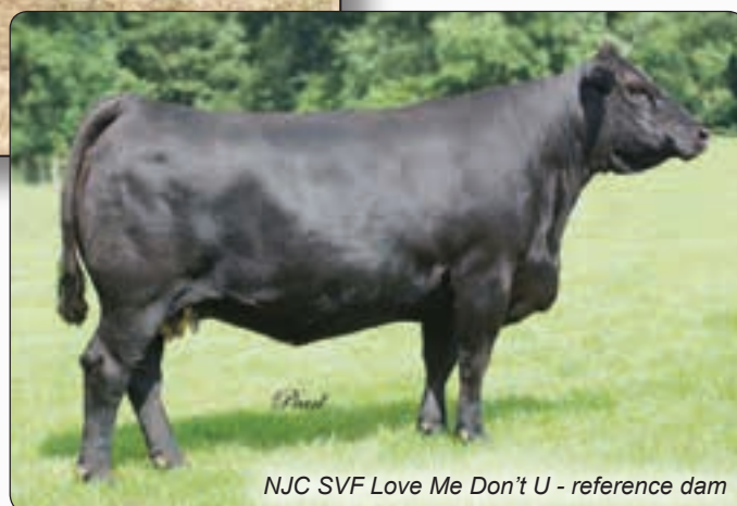
NJC SVF Love Me Don't U - reference dam