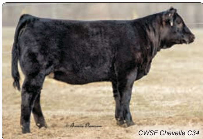
CWSF Chevelle C34

Immediately adjacent to Mountain View Farm is the "Land of Little Horses" which provides a great miniature horse show for the youngsters.