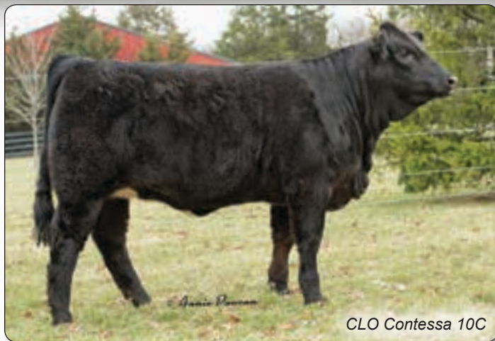
CLO Contessa 10C