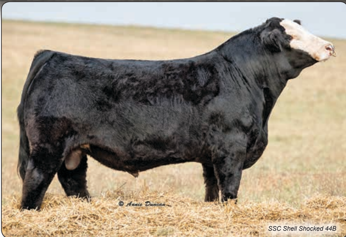
SSC Shell Shocked 44B