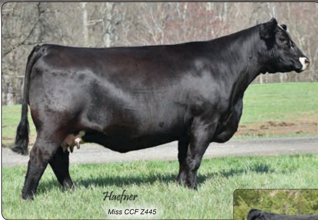
Miss CCF Z445