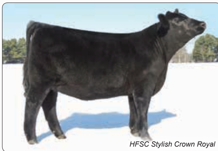
HFSC Stylish Crown Royal