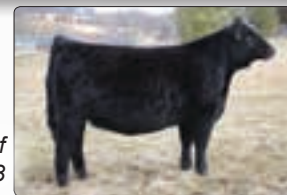
Daughter of MF Miss Built Right U533