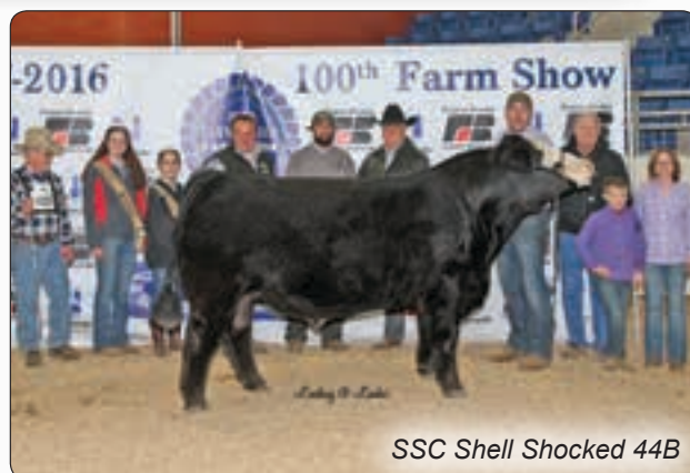
SSC Shell Shocked 44B