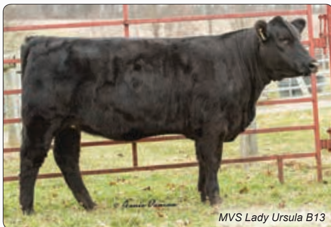
MVS Lady Ursula B13