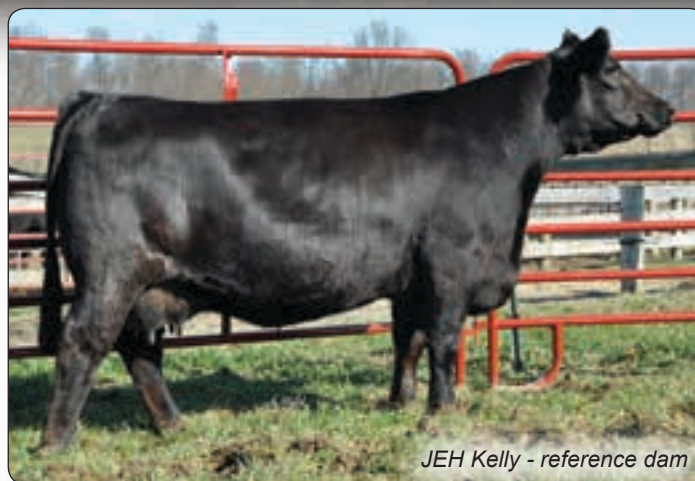
JEH Kelly - reference dam