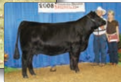
CLO Star Struck - reference dam