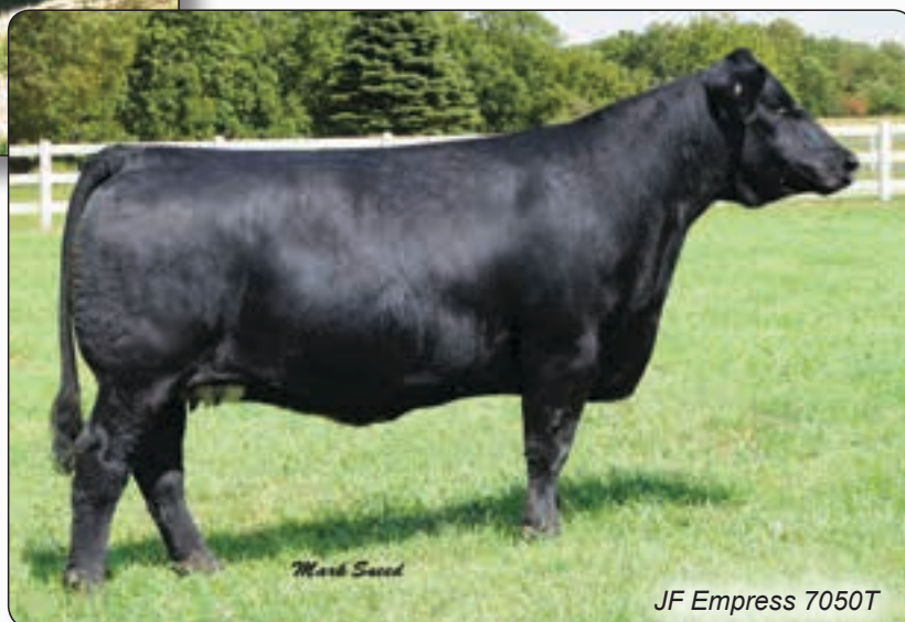
JF Empress 7050T