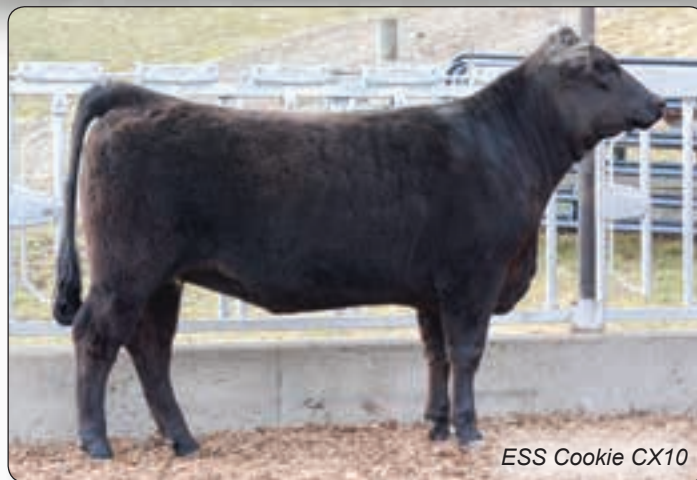
ESS Cookie CX10