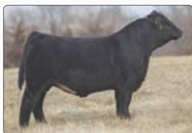
RB HPF-GF Exposition RB16Z - reference AI sire