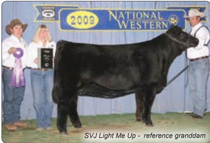
SVJ Light Me Up - reference granddam