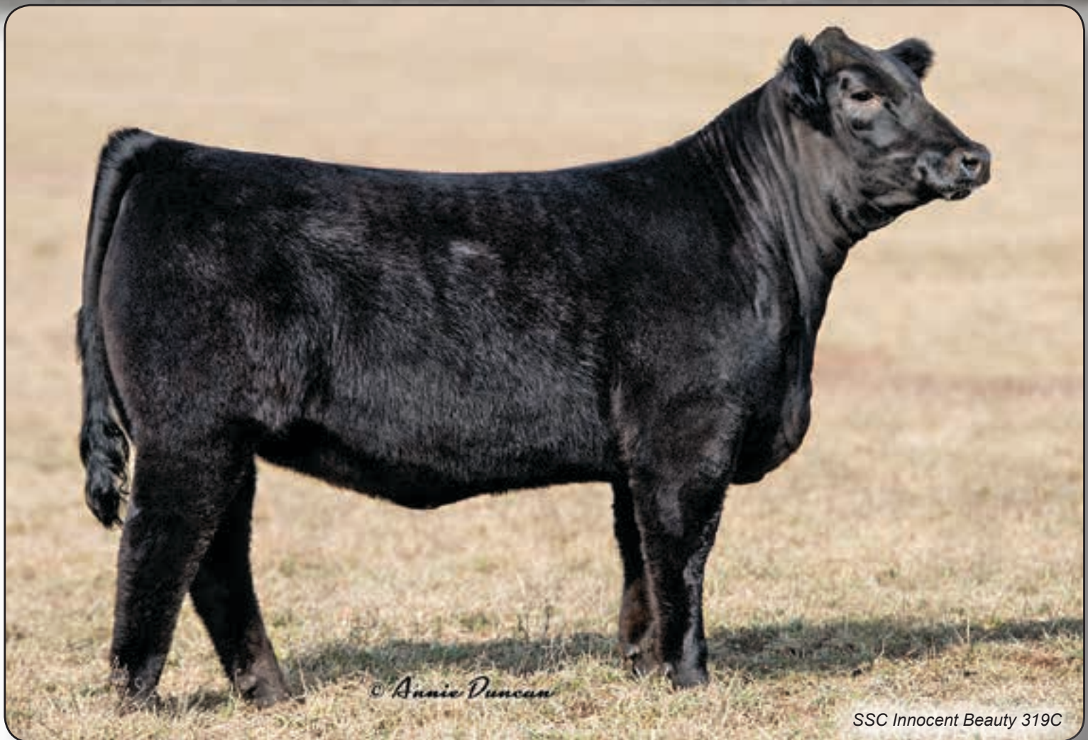
SSC Innocent Beauty 319C