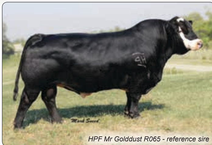
HPF Mr Golddust R065 - reference sire