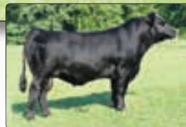
CLRWTR Shock Force W94C - reference sire