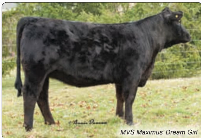
MVS Maximus' Dream Girl