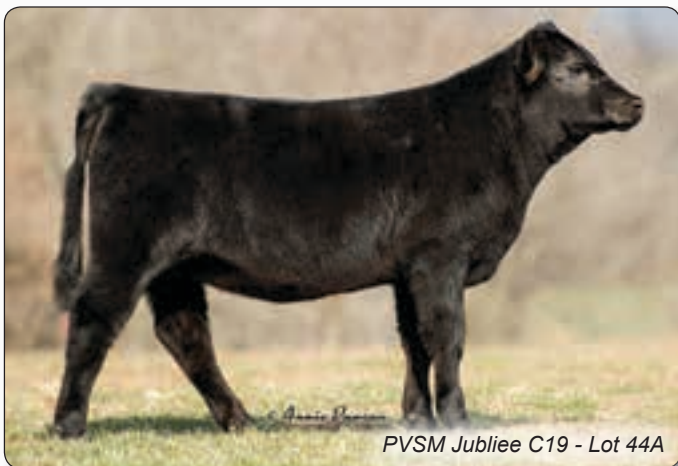
PVSM Jubilee C19 - Lot 44A

Mountain View Farm is located about one hour from Hershey, PA – Chocolate Town USA. Tours of the factory and surrounding attractions are open year around.