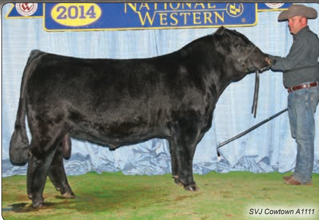
SVJ Cowtown A1111