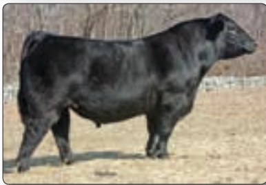
HPF CMFM Heartbreaker Z323 - reference calf sire