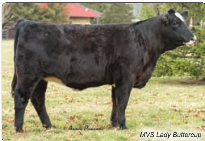
MVS Lady Buttercup