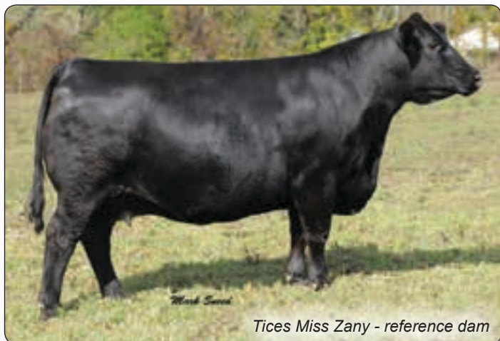
Tices Miss Zany - reference dam