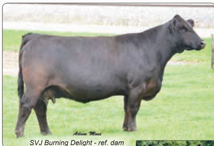
SVJ Burning Delight - ref. dam