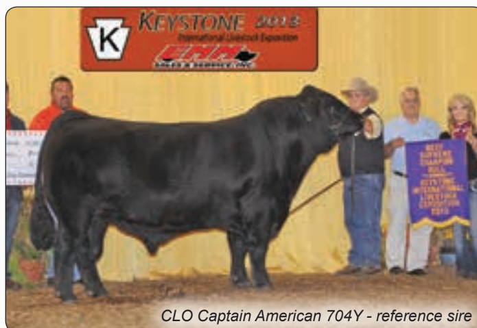
CLO Captain American 704Y - reference sire