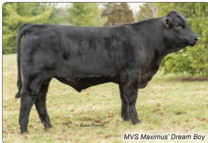
MVS Maximus' Dream Boy