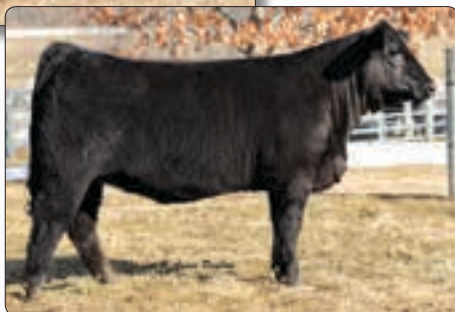
Lazy H Shez Too Cool W58 daughters