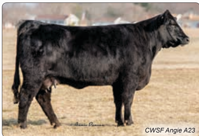
CWSF Angie A23