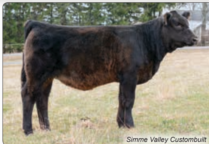
Simme Valley Custombuilt