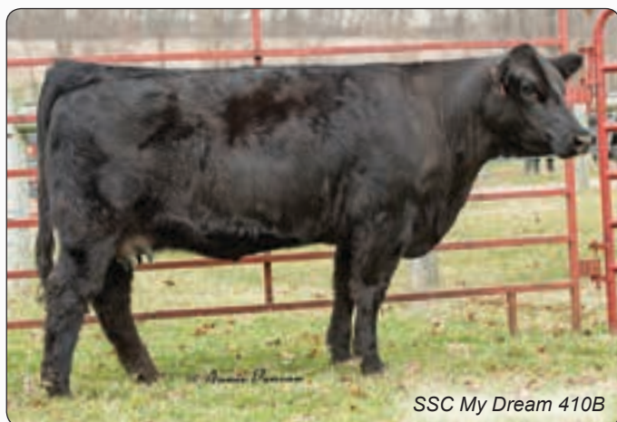
SSC My Dream 410B