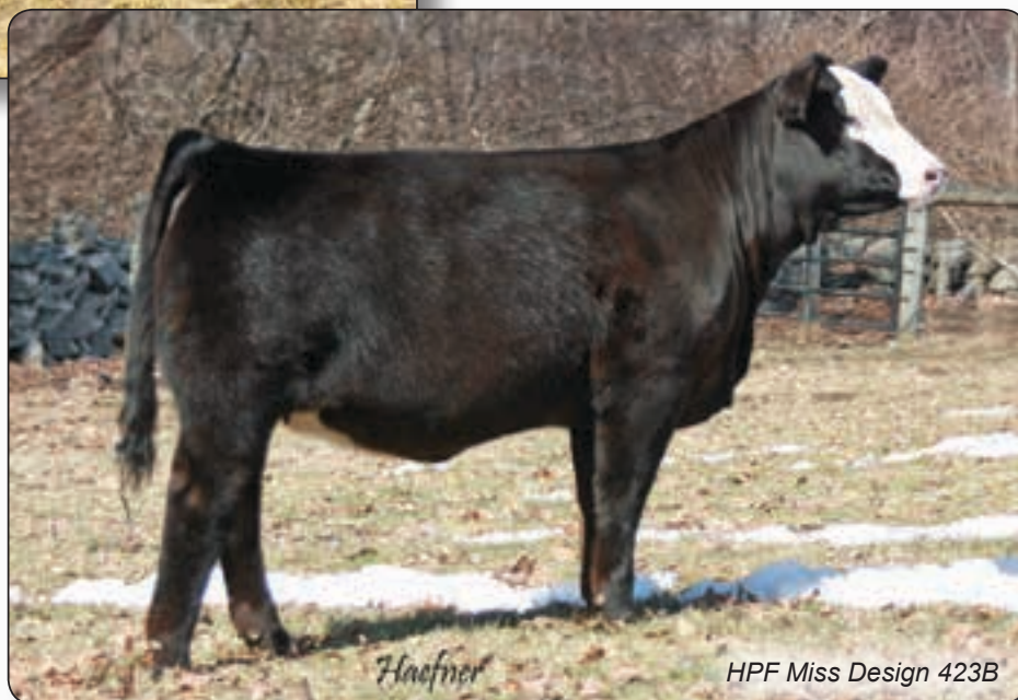
HPF Miss Design 423B