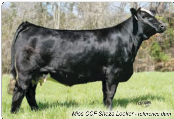
Miss CCF Sheza Looker - reference dam