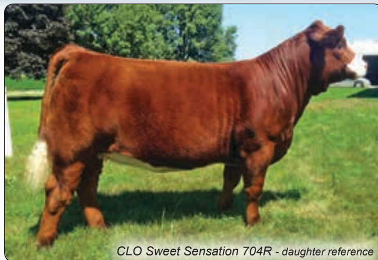
CLO Sweet Sensation 704R - daughter reference