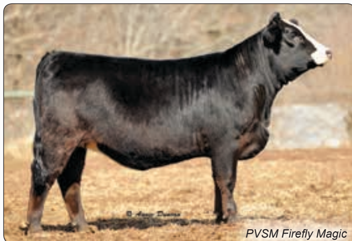
PVSM Firefly Magic