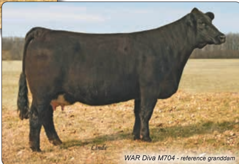
WAR Diva M704 - reference granddam