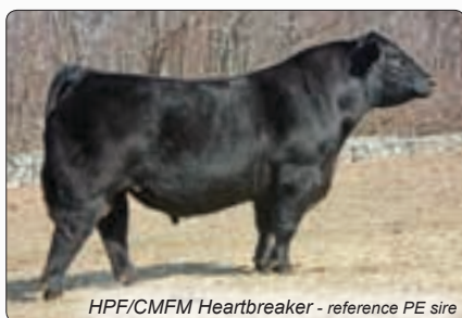
HPF/CMFM Heartbreaker - reference PE sire