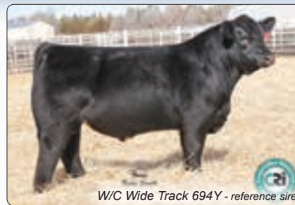
W/C Wide Track 694Y - reference sire