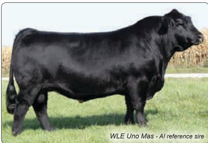
WLE Uno Mas - AI reference sire