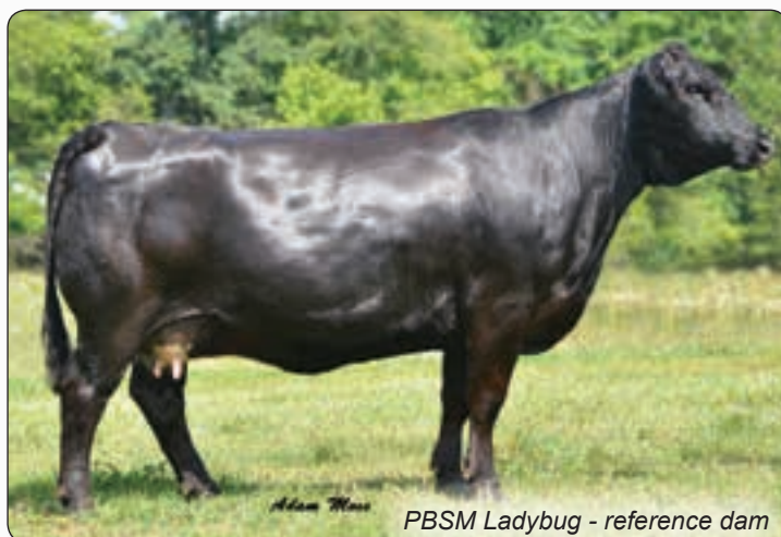
PVSM Ladybug - reference dam