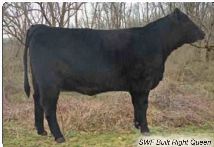
SWF Built Right Queen