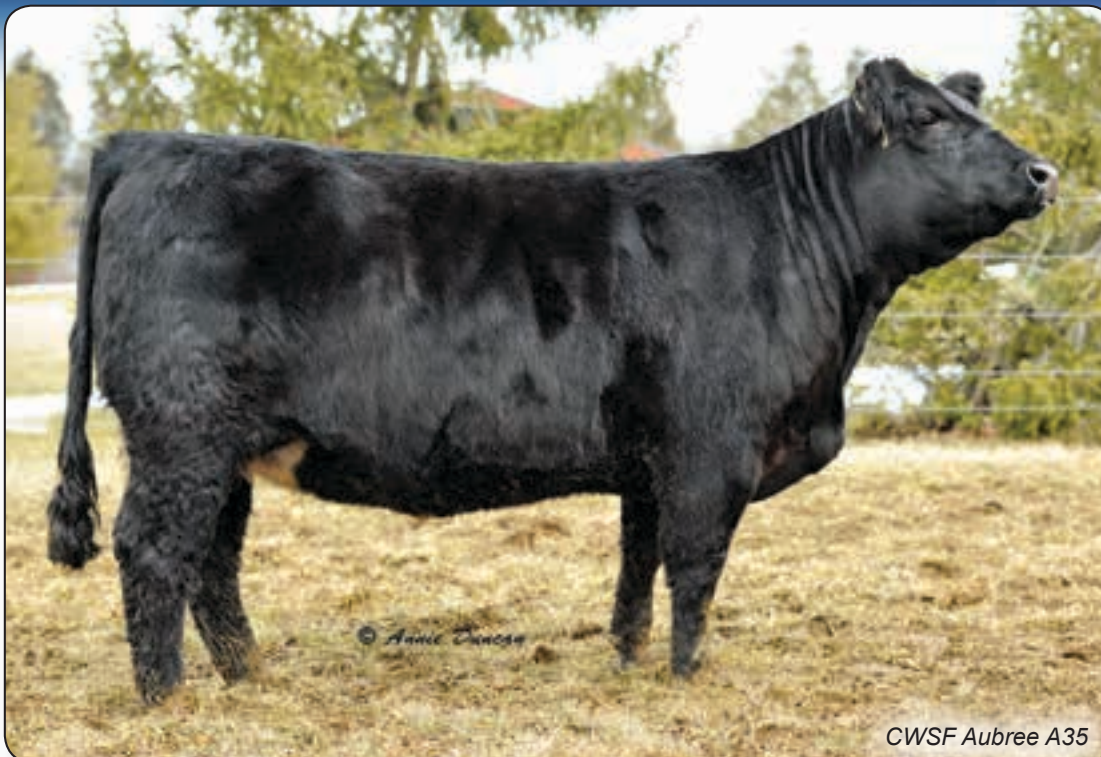
CWSF Aubree A35