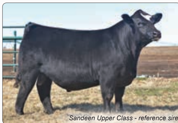
Sandeen Upper Class - reference sire