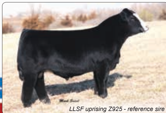
LLSF uprising Z925 - reference sire