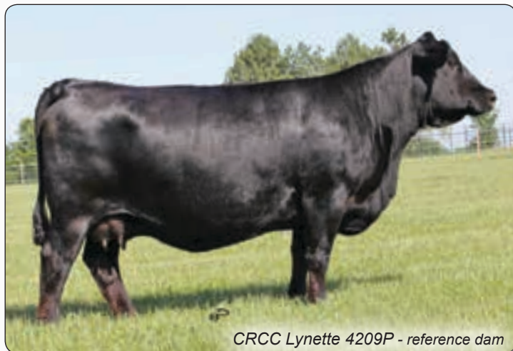
CRCC Lynette 4209P - reference dam