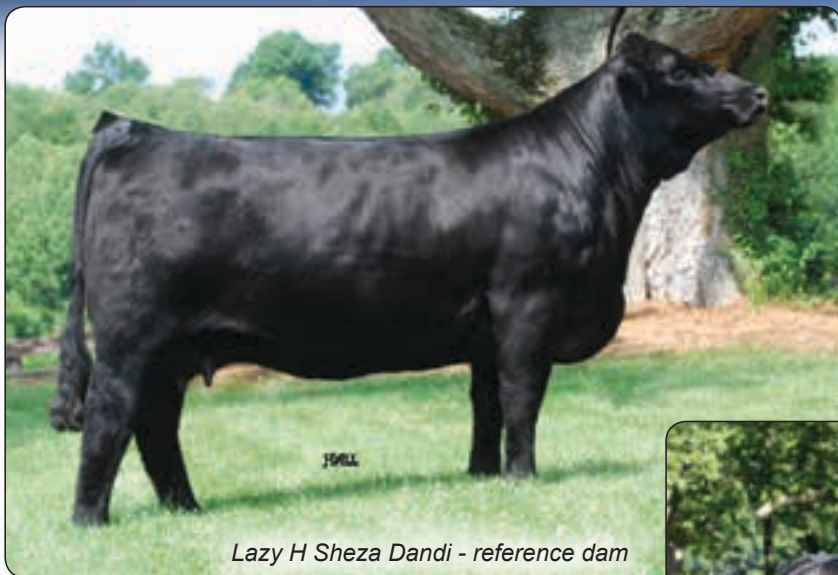
Lazy H Sheza Dandi - reference dam