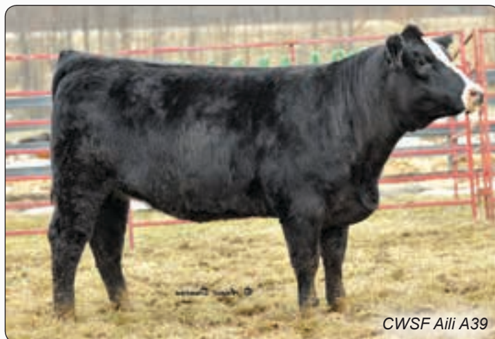
CWSF Aili A39