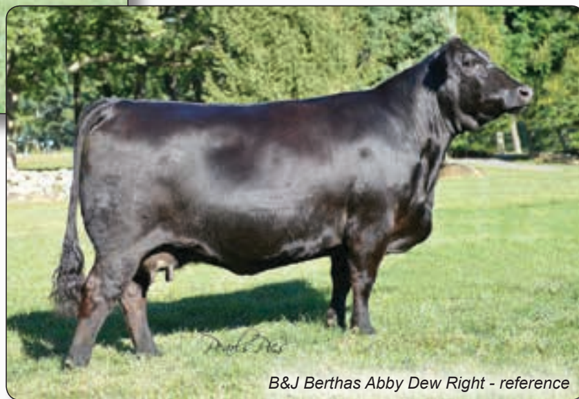
B&J Berthas Abby Dew Right - reference