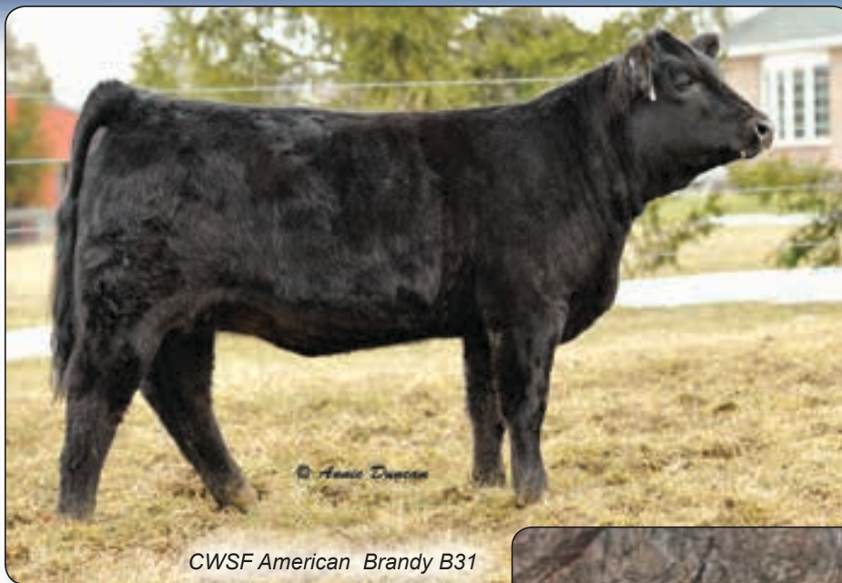
CWSF American Brandy B31