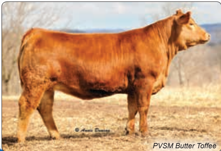
PVSM Butter Toffee