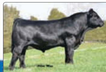
CVLS Extra Mile 303A - reference sire