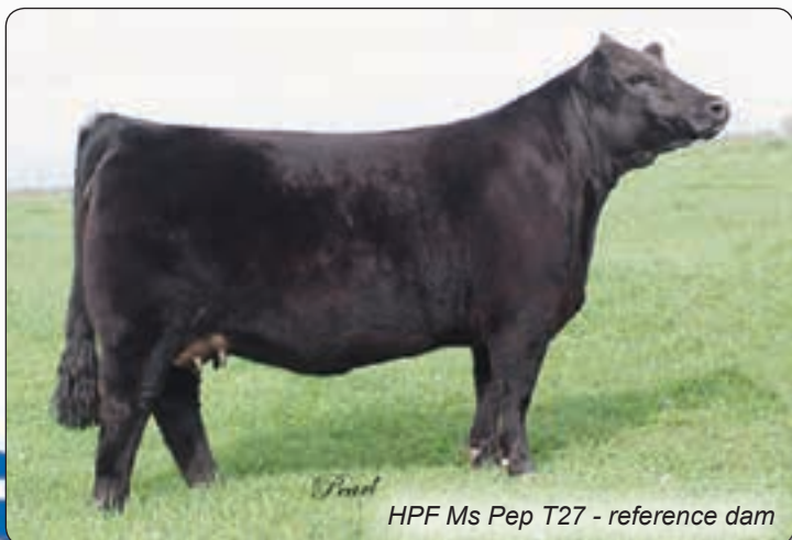
HPF Ms Pep T27 - reference dam

Immediately adjacent to Mountain View Farm is the "Land of Little Horses" which provides a great miniature horse show for the youngsters.