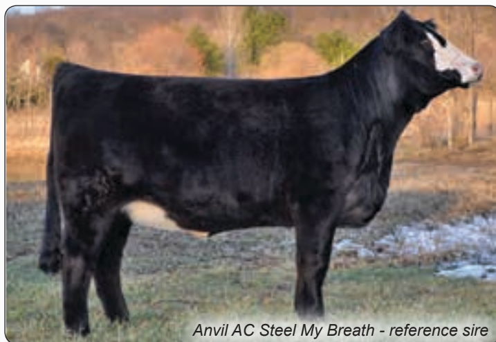
Anvil AC Steel My Breath - reference sire

Past stars and stripes top sellers now donors!