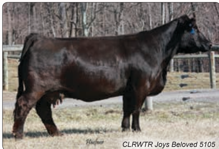
CLRWTR Joys Beloved 5105