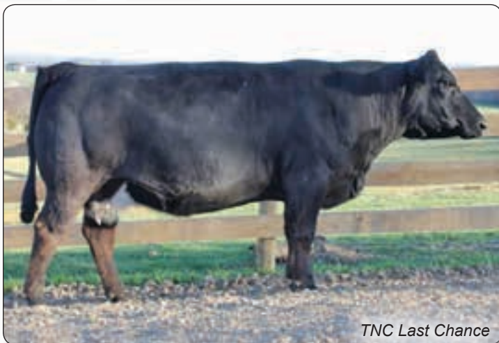
TNC Last Chance