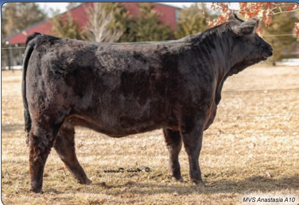
MVS Anastasia A10