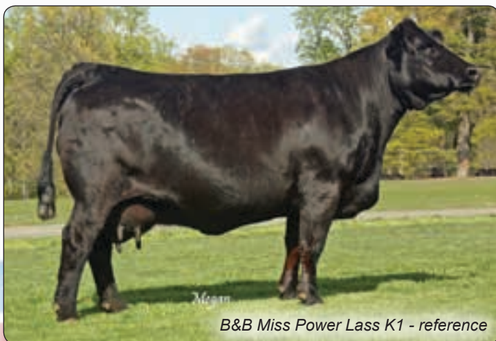
B&amp;B Miss Power Lass K1 - reference