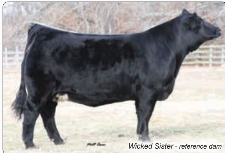
Wicked Sister - reference dam