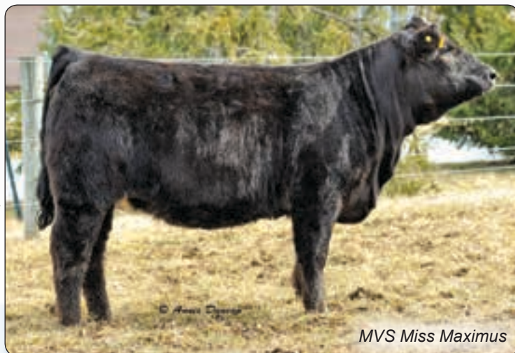
MVS Miss Maximus