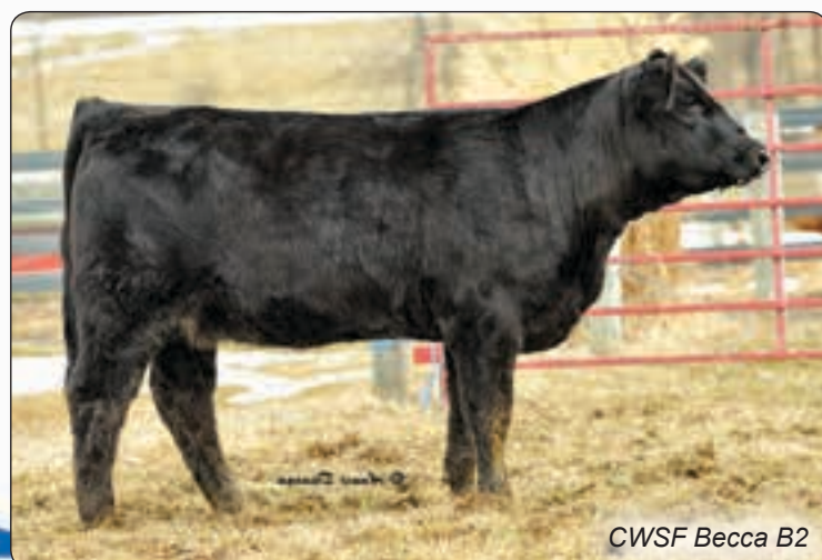
CWSF Becca B2