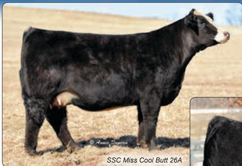
SSC Miss Cool Butt 26A