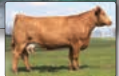
SVF Sheza Glory N901 - reference granddam