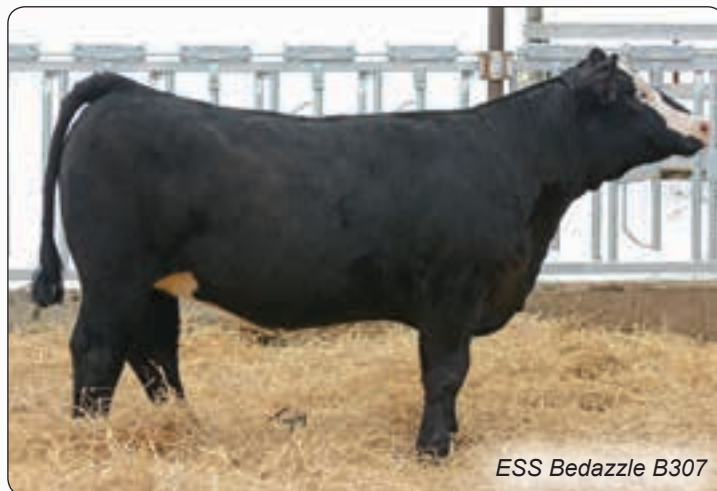
ESS Bedazzle B307