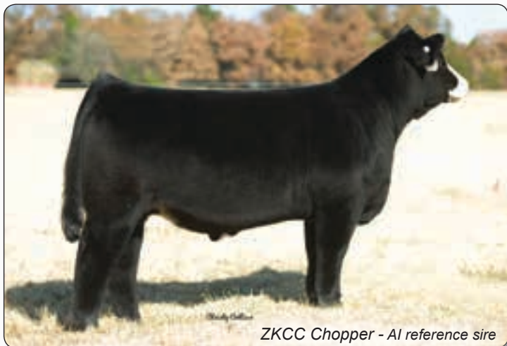
ZKCC Chopper - AI reference sire