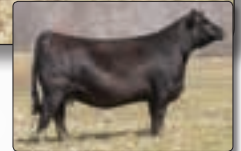
SS/TBT Khloe 200Y - reference dam