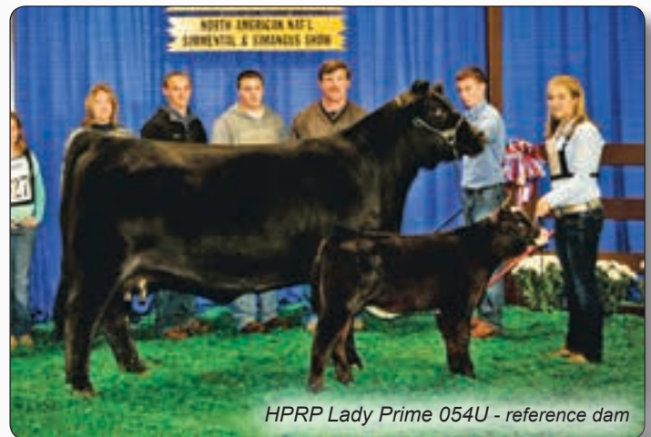
HPRP Lady Prime 054U - reference dam

Mountain View Farm is located in the antique capital of the nation centered in Adams and Lancaster counties. The nearby Gettysburg Outlet Mall offers shopping at numerous famous brand stores.