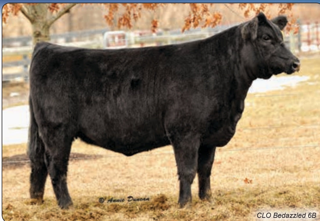
CLO Bedazzled 6B