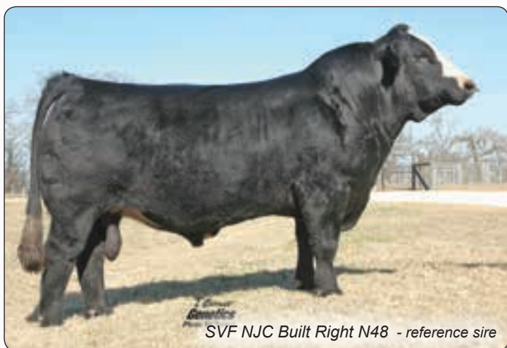
SVF NJC Built Right N48 - reference sire