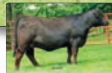
JM Olivia L36 - flushmate to P13