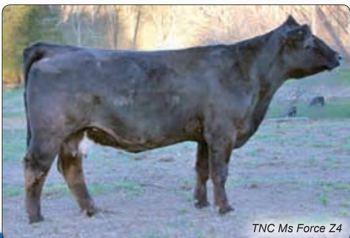
TNC Ms Force Z4