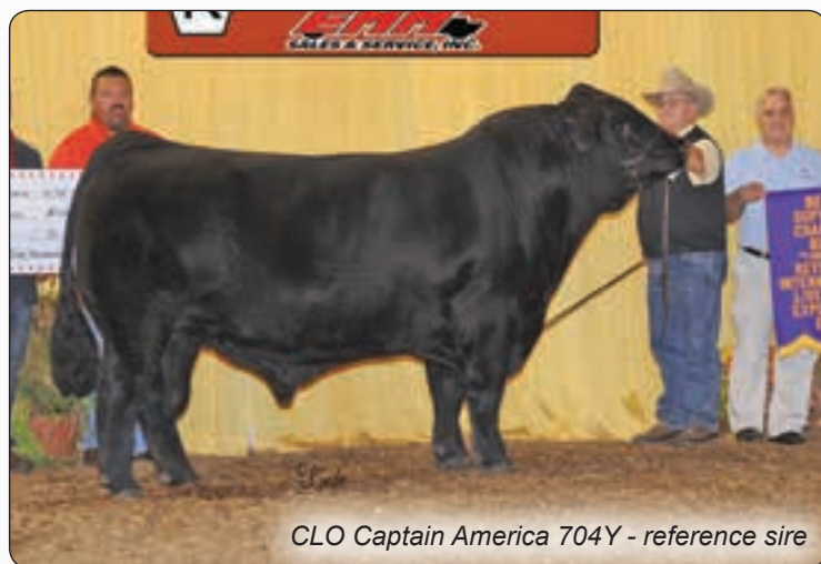
CLO Captain America 704Y - reference sire