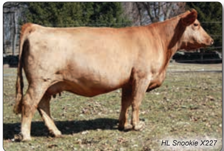
HL Snookie X227