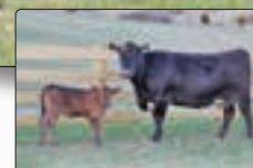
Picture of Recipient