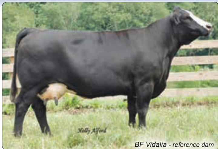
BF Vidalia - reference dam