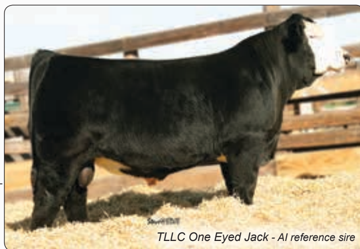
TLLC One Eyed Jack - AI reference sire