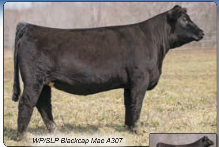
WP/SLP Blackcap Mae A307