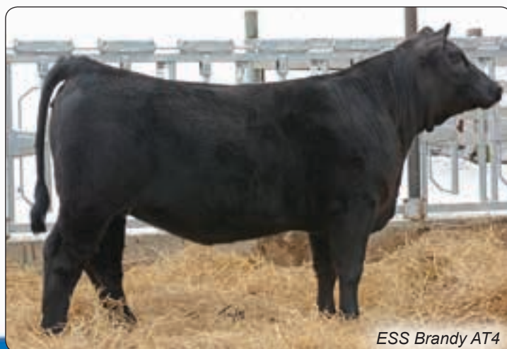
ESS Brandy AT4