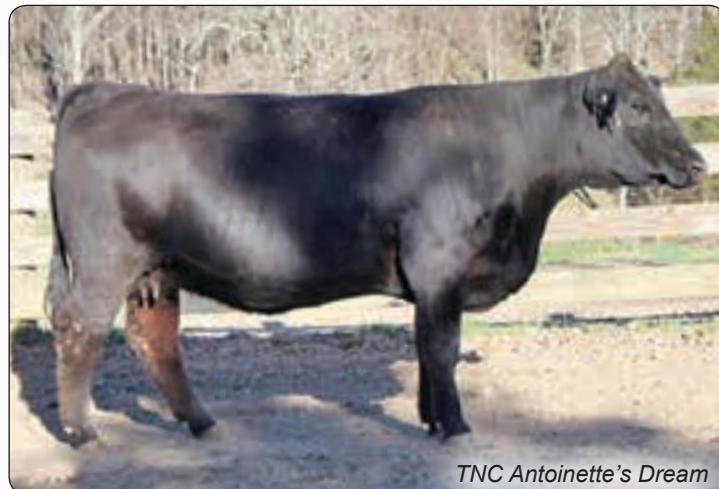
TNC Antoinette's Dream