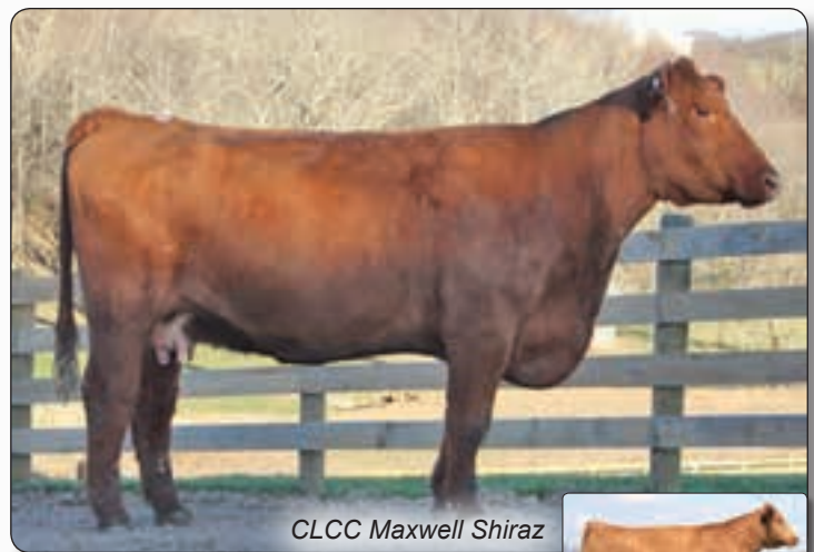
CLCC Maxwell Shiraz