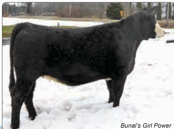
Bunal's Girl Power