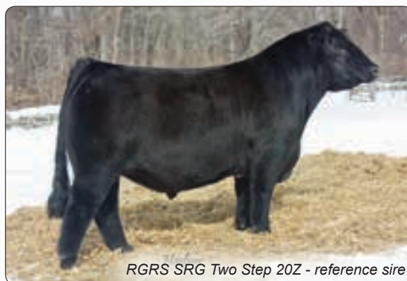
RGRS SRG Two Step 20Z - reference sire