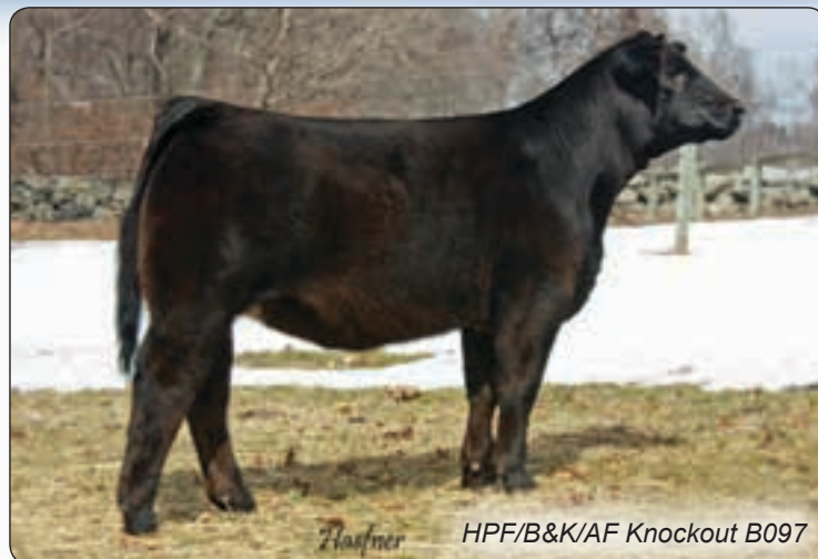
HPF/B&amp;K/AF Knockout B097