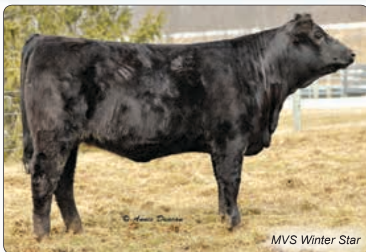
MVS Winter Star