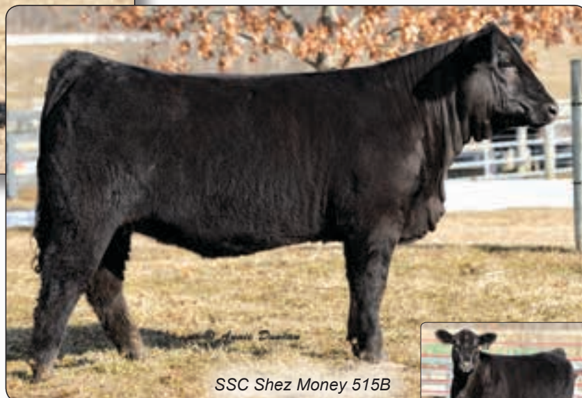
SSC Shez Money 515B