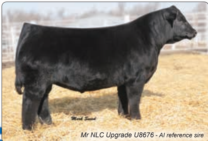
Mr NLC Upgrade U8676 - AI reference sire