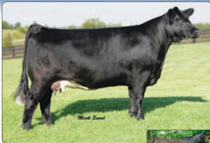
KenCo Mile Cottontail - full Sibling in blood to pregnancy