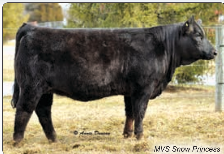
MVS Snow Princess