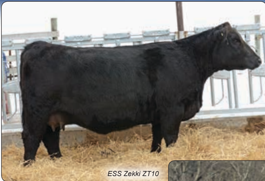
ESS Zekki ZT10