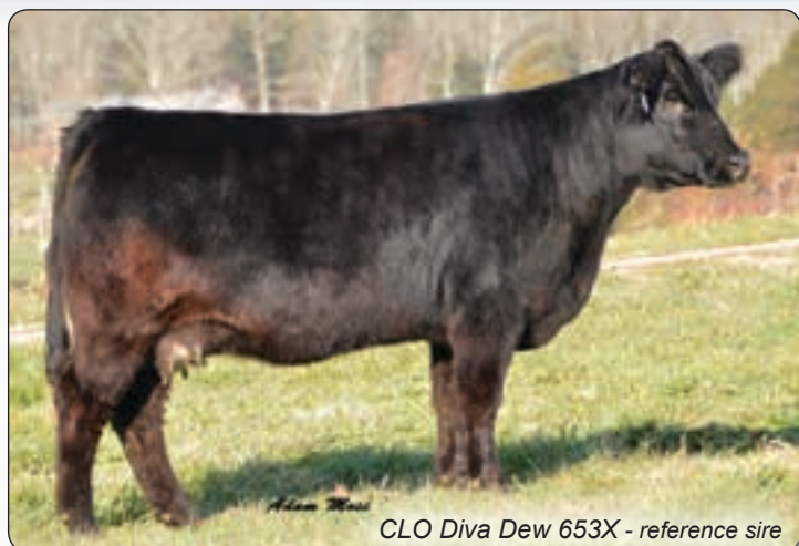
CLO Diva Dew 653X - reference sire