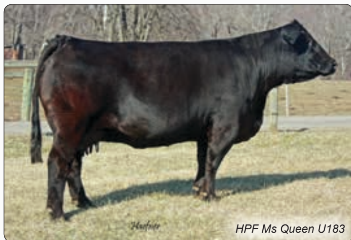
HPF Ms Queen U183