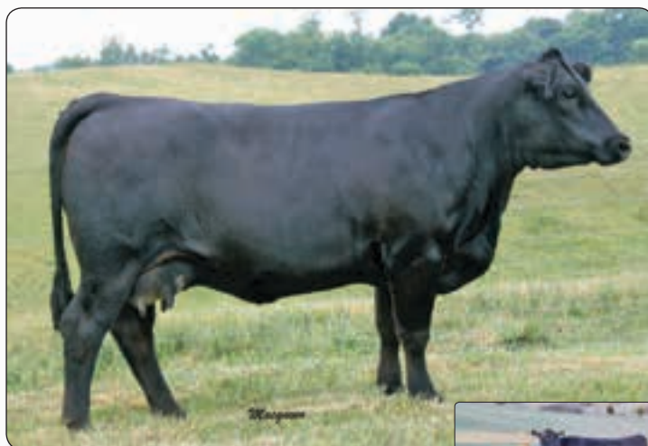
EBS Shesa Andrias Dream - reference dam