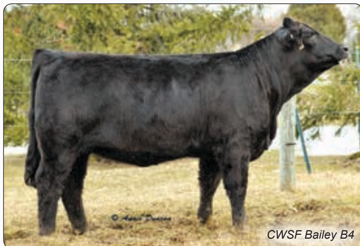
CWSF Bailey B4

• consignor: Curry Wagner Simmental Farm