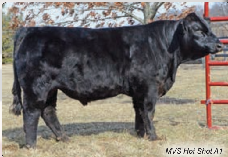
MVS Hot Shot A1