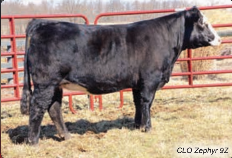
CLO Zephyr 9Z

MWW: 56 • MRB: -0.12 • REA: 0.71 • API: 108.5