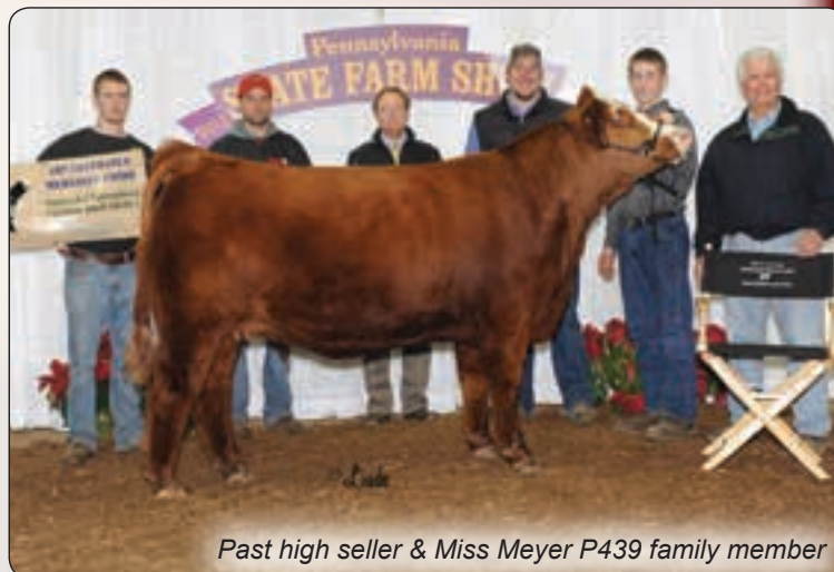
Past high seller & Miss Meyer P439 family member