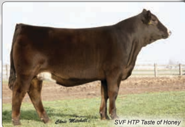
SVF HTP Taste of Honey