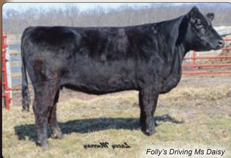
Folly's Driving Ms Daisy