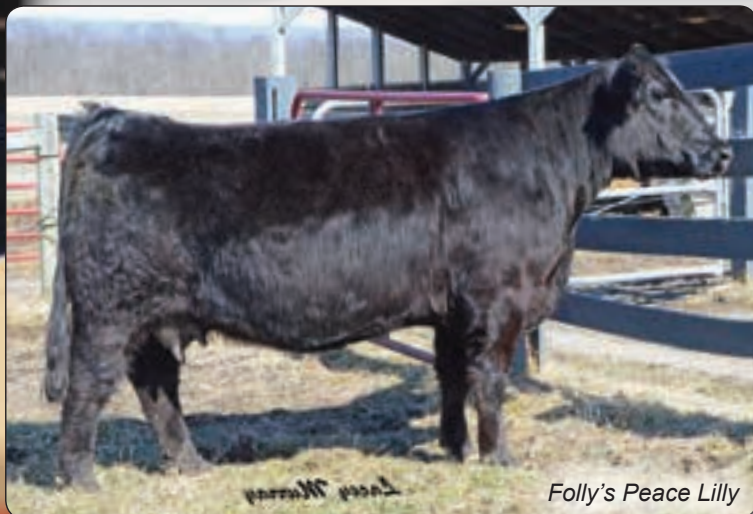
Folly's Peace Lilly