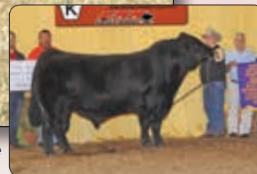
CLO Captain America 704Y - reference sire