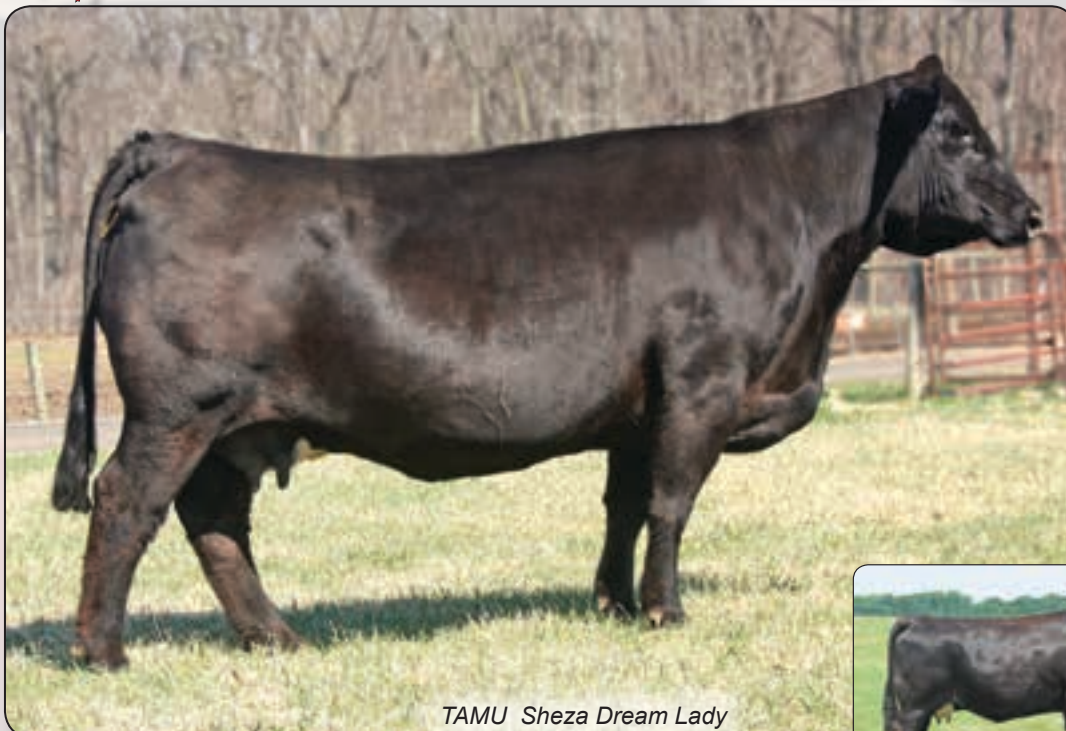
TAMU Sheza Dream Lady