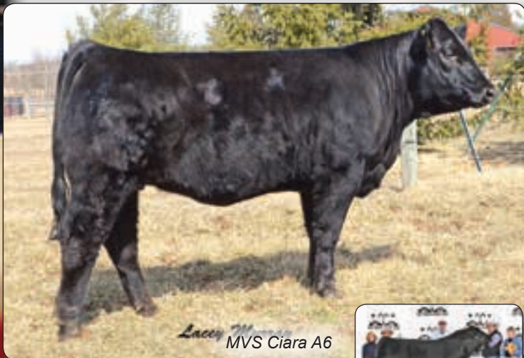
MVS Ciara A6