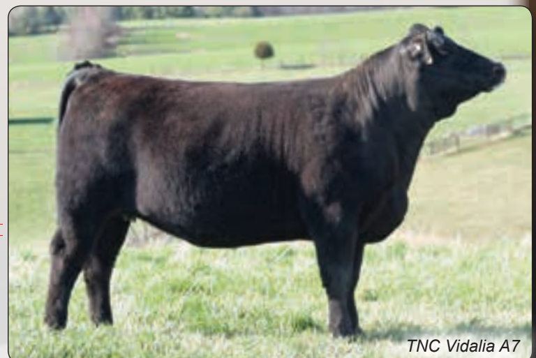
TNC Vidalia A7