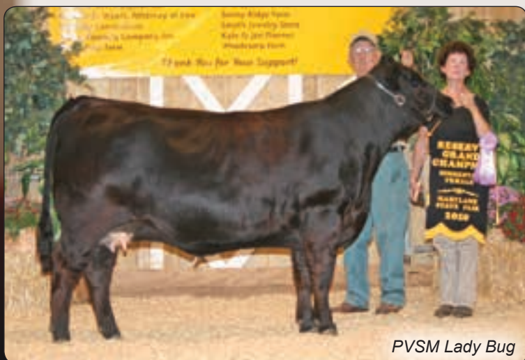
PVSM Lady Bug