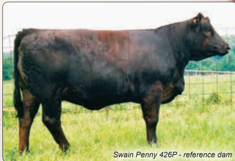
Swain Penny 426P - reference dam