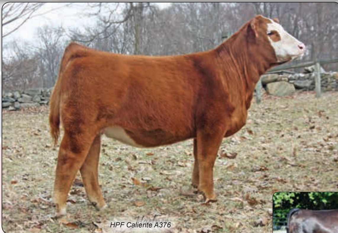
HPF Caliente A376