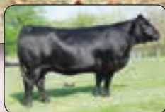
WW Miss Pep 58N - reference dam