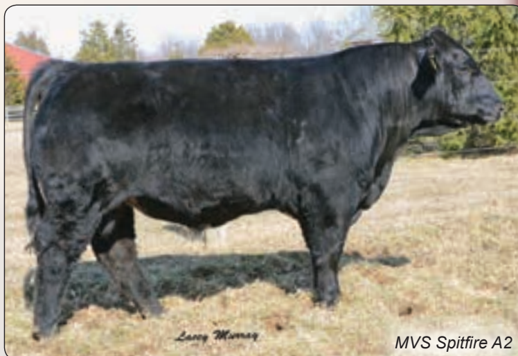
MVS Spitfire A2