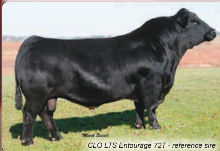
CLO LTS Entourage 72T - reference sire