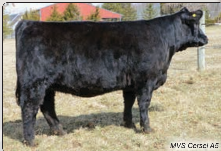
MVS Cersei A5