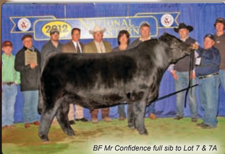
BF Mr Confidence full sib to Lot 7 & 7A