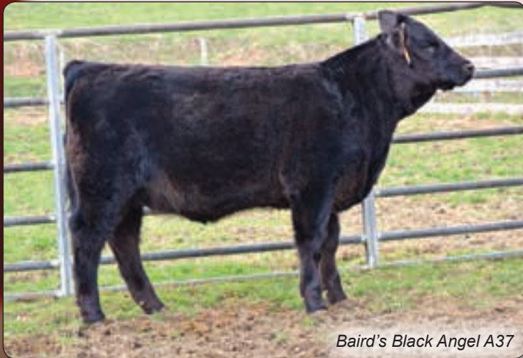
Baird's Black Angel A37