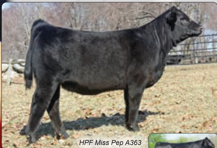
HPF Miss Pep A363