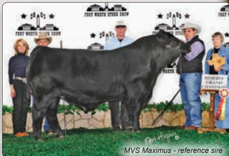
MVS Maximus - reference sire