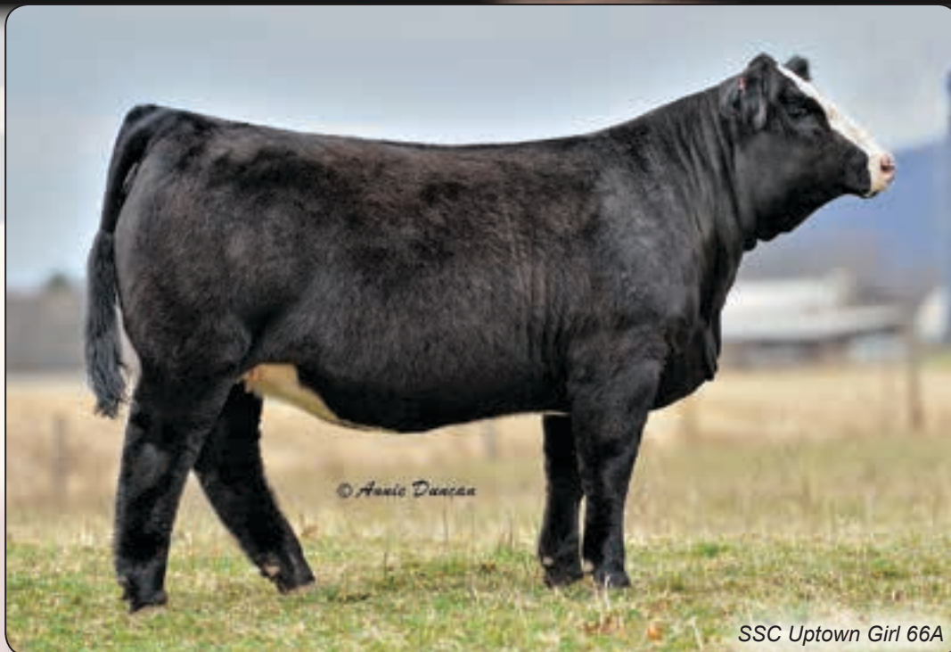
SSC Uptown Girl 66A