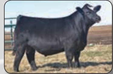
Sandeen Upper Class- reference sire