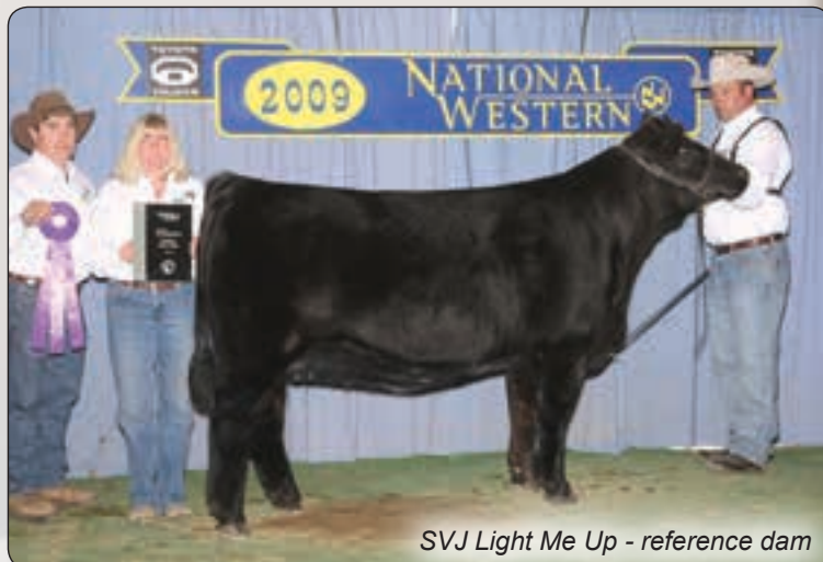
SVJ Light Me Up - reference dam