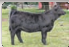
BF GCC 591B daughter