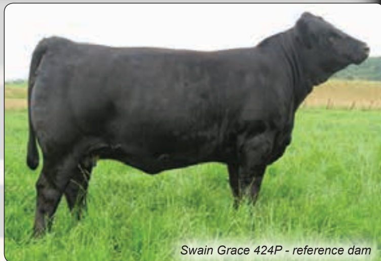
Swain Grace 424P - reference dam