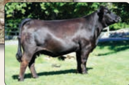
HPF Caliente U335 - reference dam