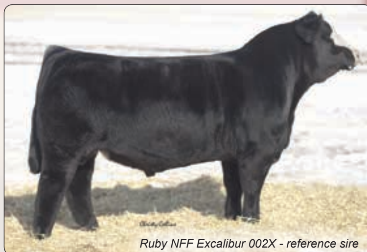
Ruby NFF Excalibur 002X - reference sire