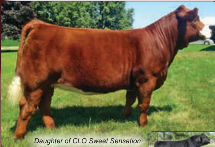
Daughter of CLO Sweet Sensation

MWW: 52 • MRB: -0.08 • REA: 0.59 • API: 105