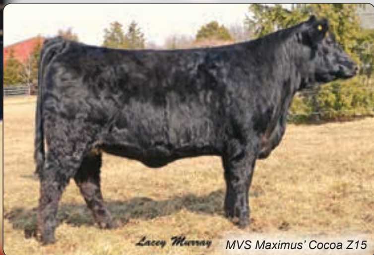
Lacey Murray MVS Maximus' Cocoa Z15