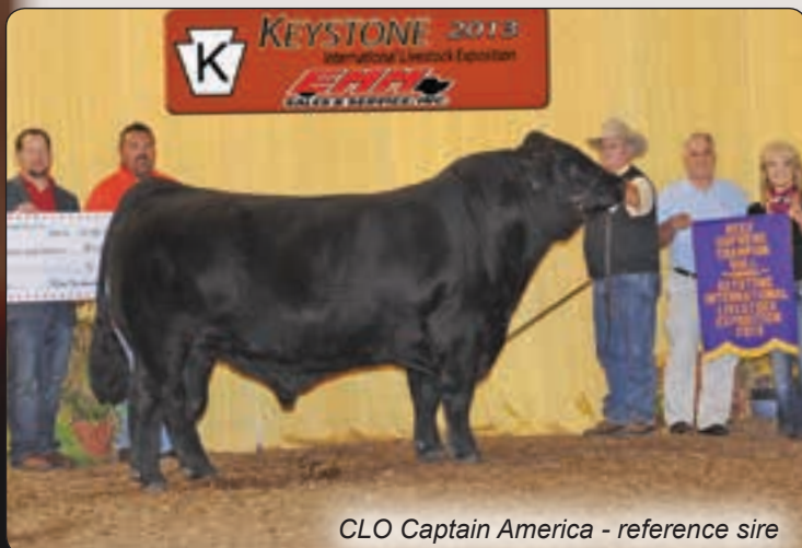
CLO Captain America - reference sire