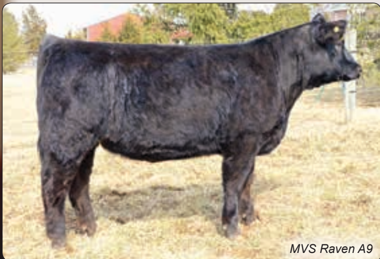
MVS Raven A9