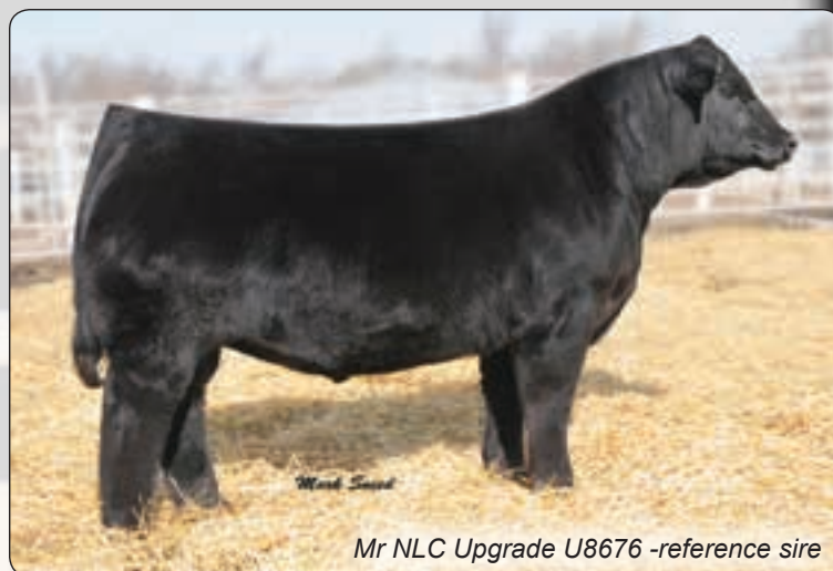
Mr NLC Upgrade U8676 -reference sire