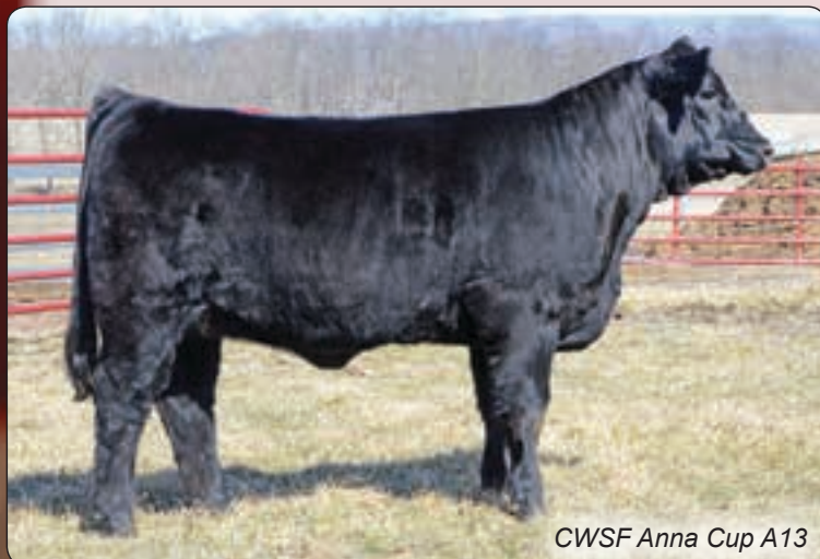
CWSF Anna Cup A13