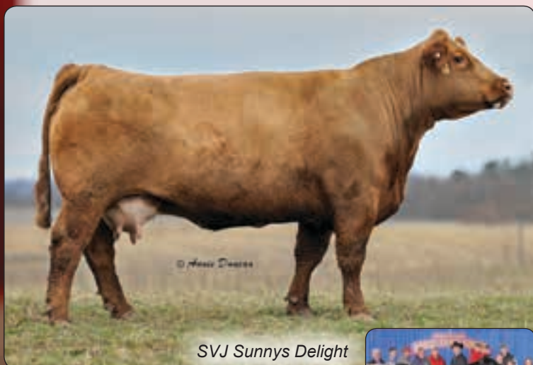
SVJ Sunnys Delight