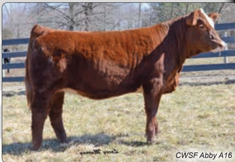
CWSF Abby A16