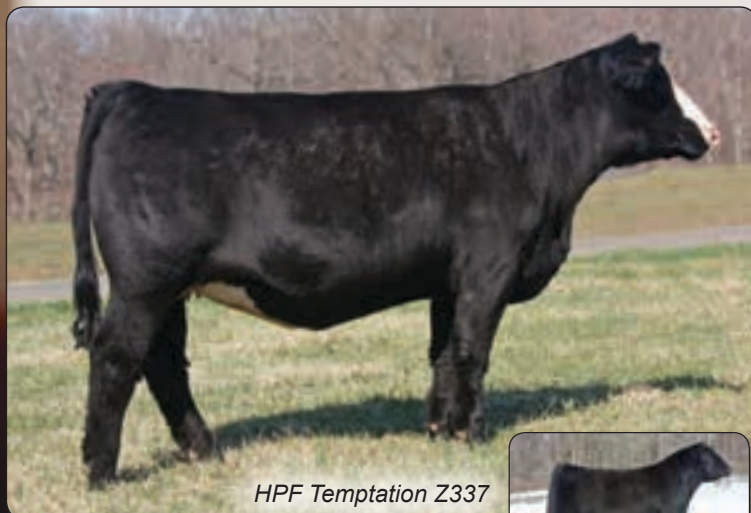
HPF Temptation Z337