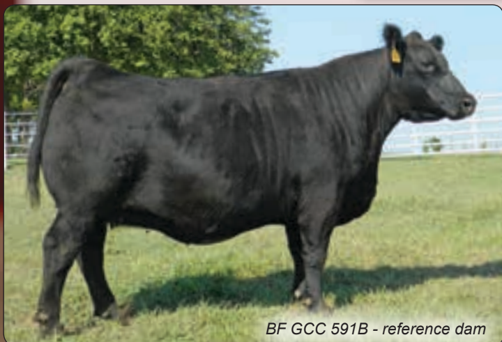
BF GCC 591B - reference dam