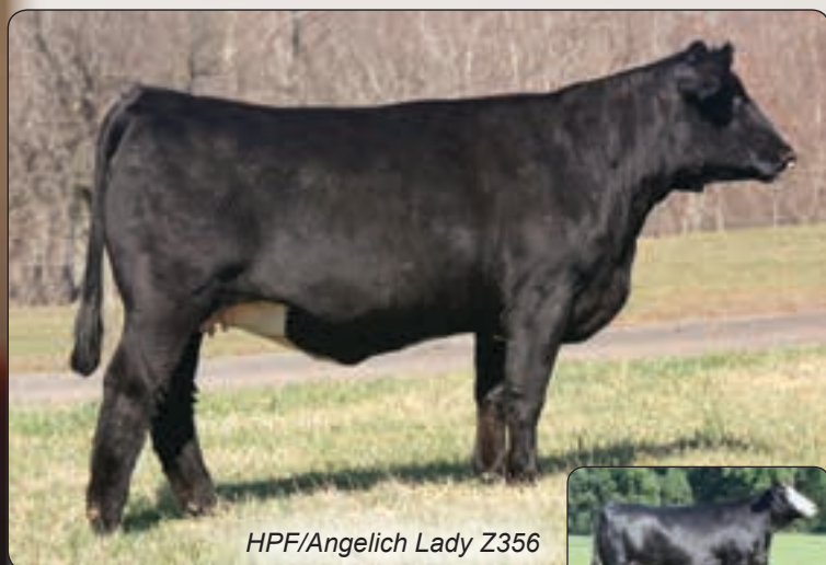
HPF/Angelich Lady Z356