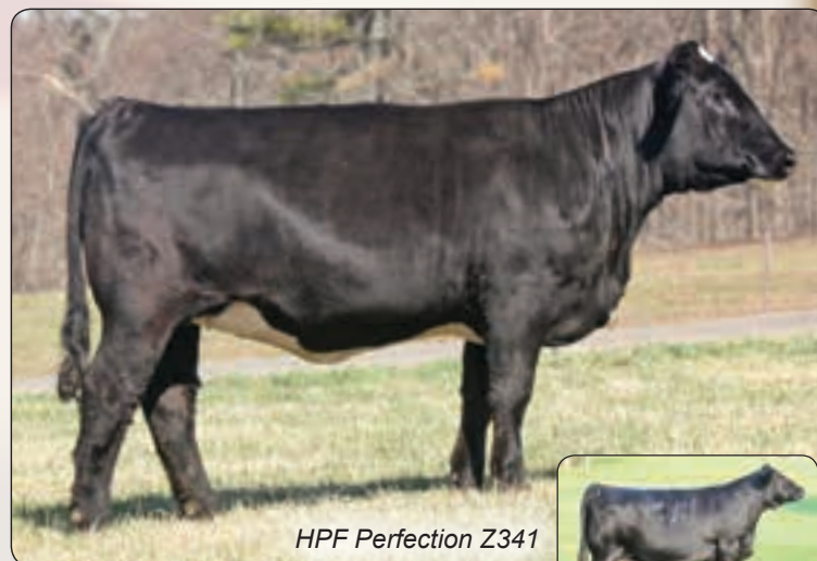
HPF Perfection Z341