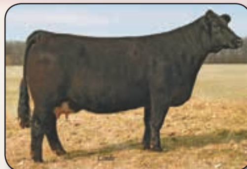
WAR Diva - reference granddam