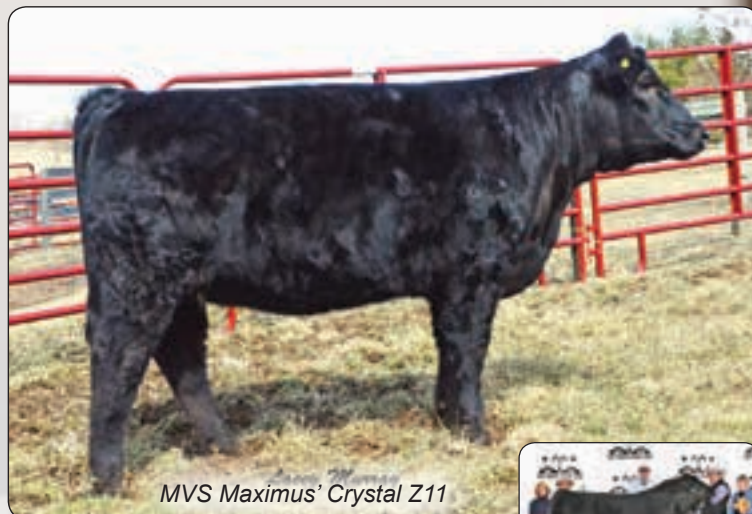
MVS Maximus' Crystal Z11