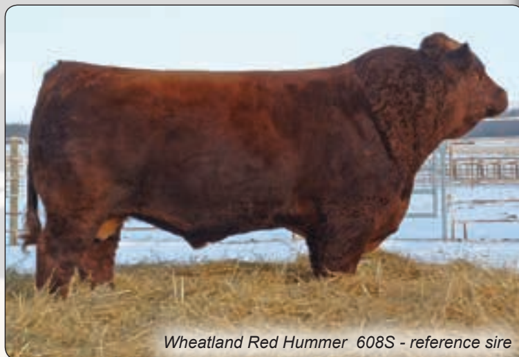
Wheatland Red Hummer 608S - reference sire