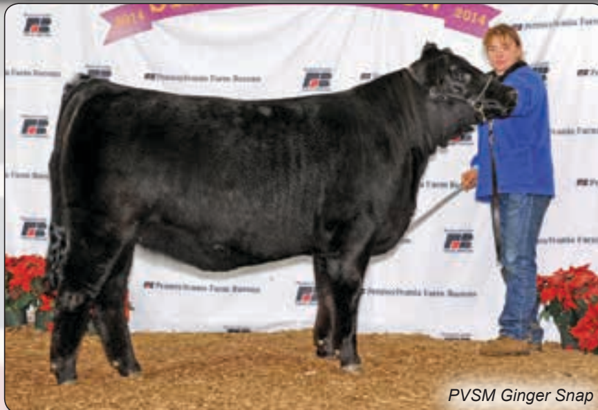
PVSM Ginger Snap