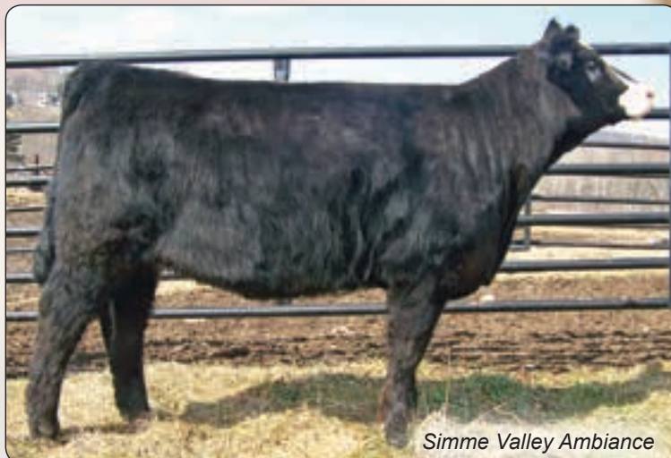
Simme Valley Ambiance