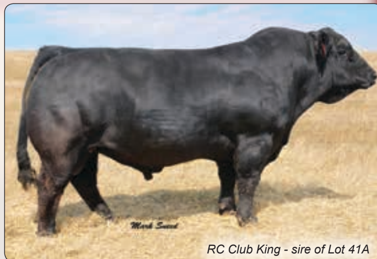
RC Club King - sire of Lot 41A