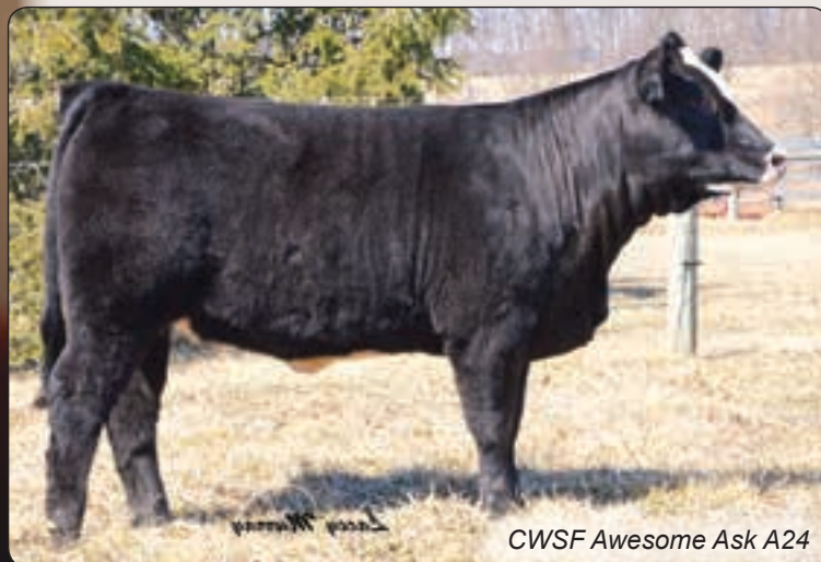
CWSF Awesome Ask A24