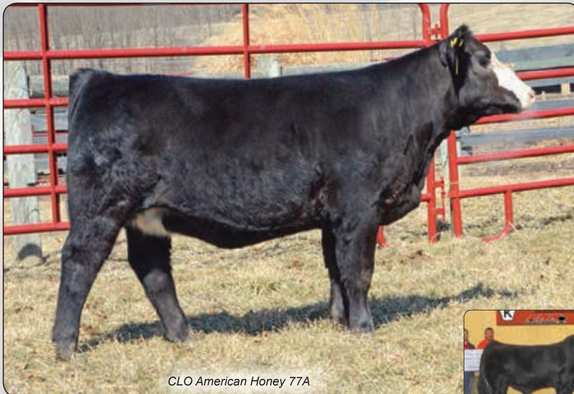
CLO American Honey 77A