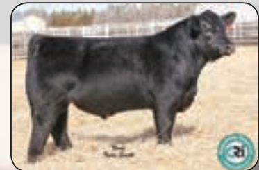
W/C Wide Track - reference sire