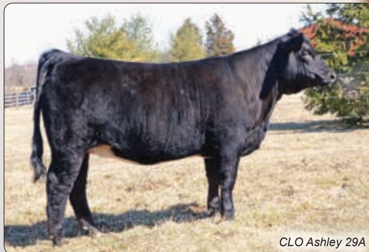
CLO Ashley 29A

View catalog online at www.parkelivestock.com