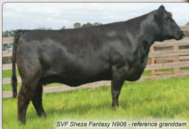
SVF Sheza Fantasy N906 - reference granddam