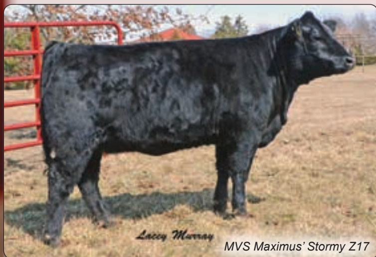
Lacey Murray MVS Maximus' Stormy Z17