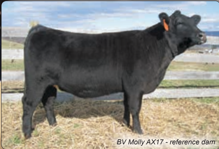
BV Molly AX17 - reference dam