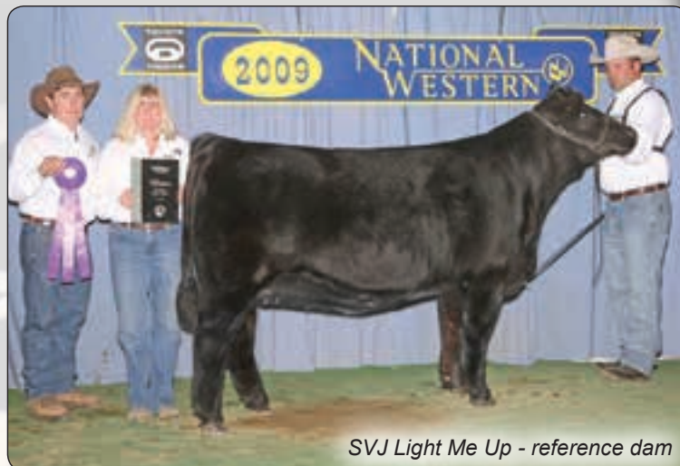
SVJ Light Me Up - reference dam