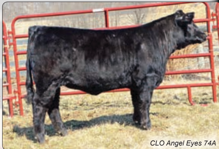
CLO Angel Eyes 74A