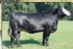
HPF Ebony's Lady S089 - reference dam